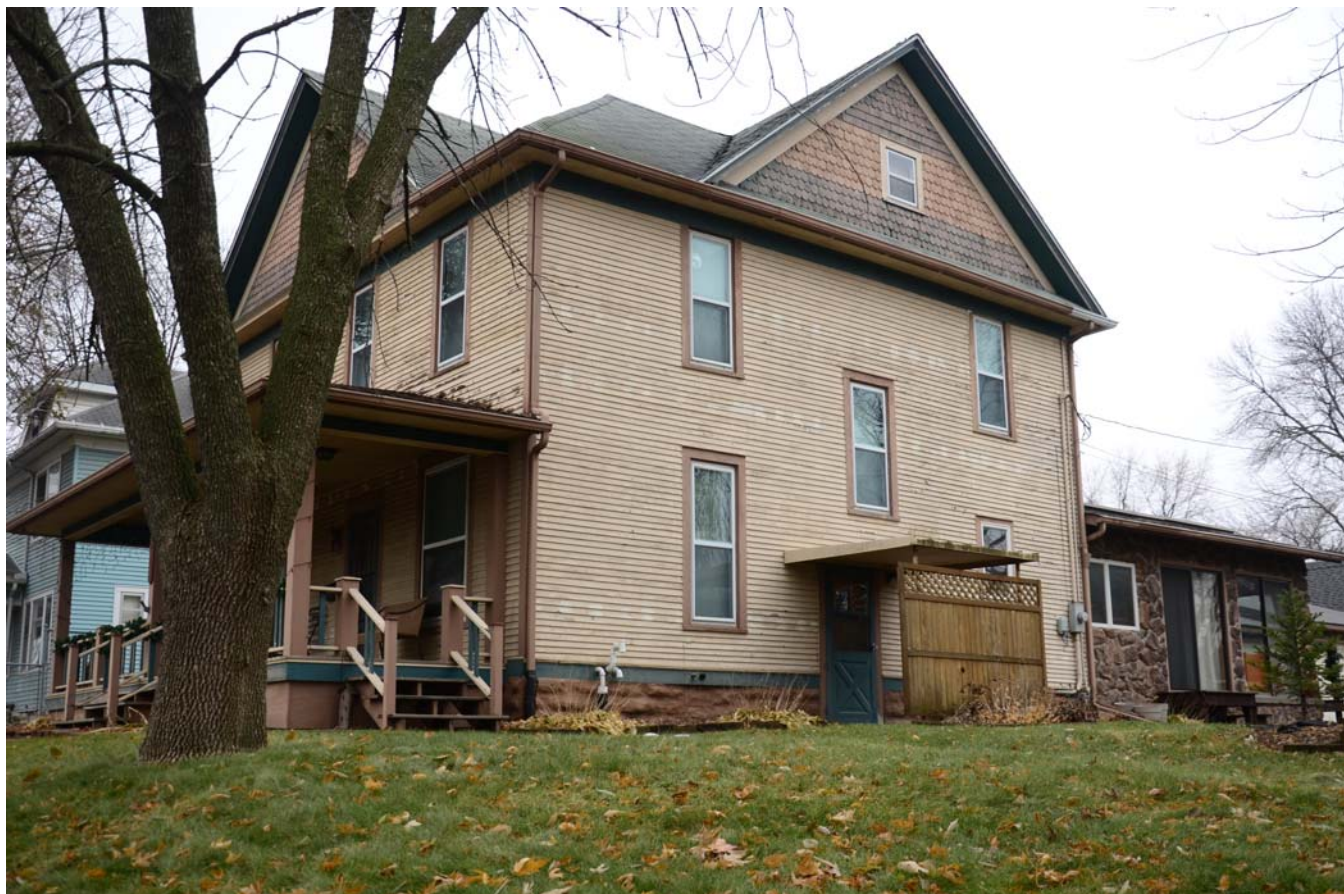
Photograph 92-00806-002 - House, looking northwest (December 2014)