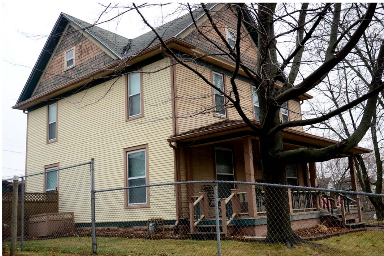
Photograph 92-00806-001 - House, looking northeast (December 2014)