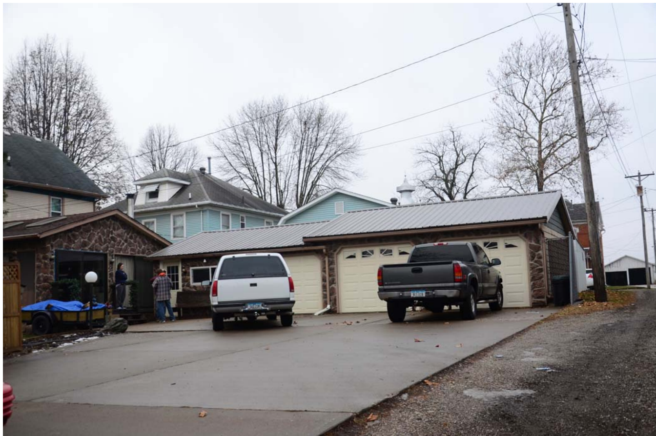
Photograph 92-00806-004 - Garage, looking southwest (December 2014)