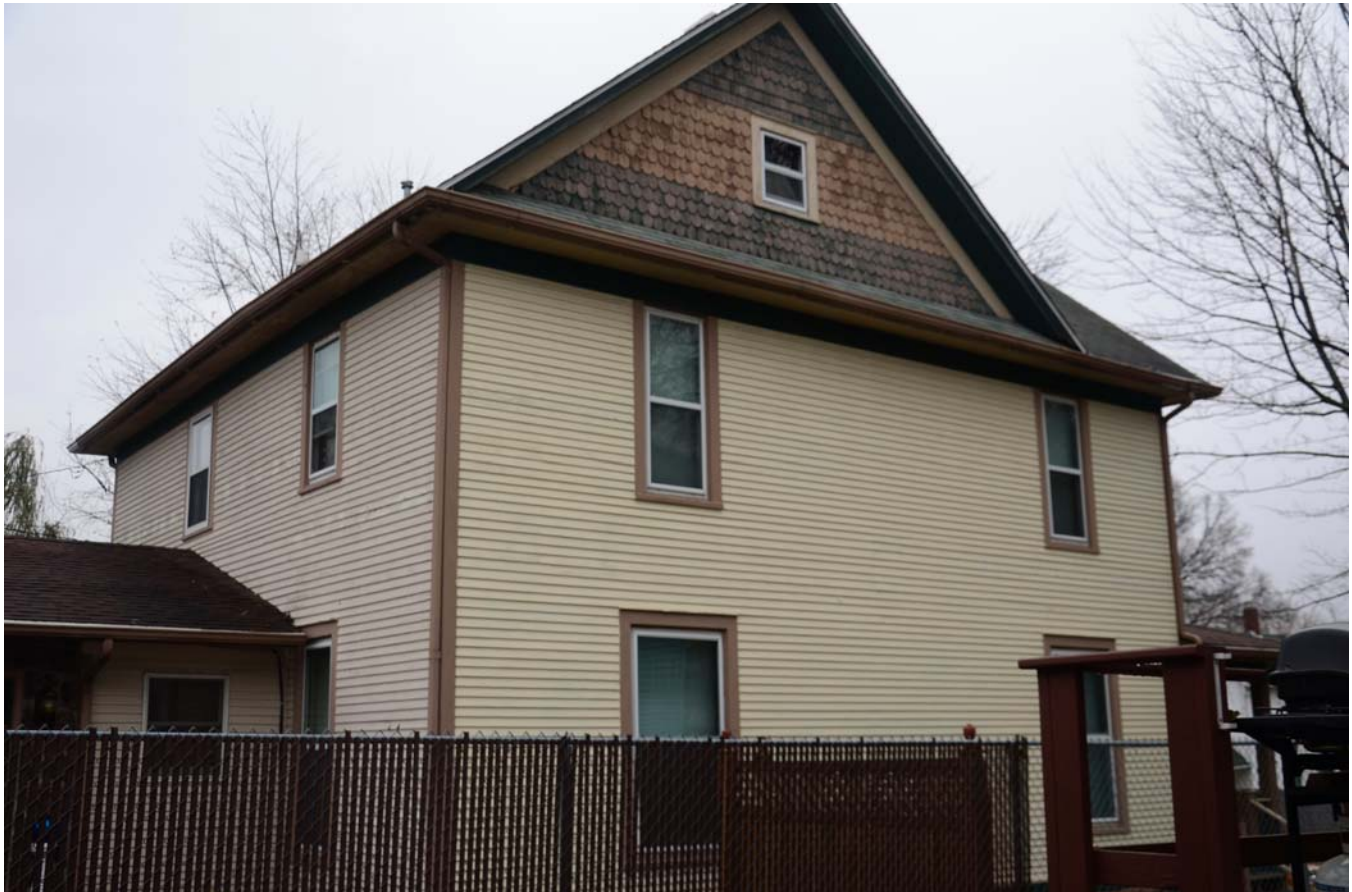
Photograph 92-00806-003 - House, looking southwest (December 2014)