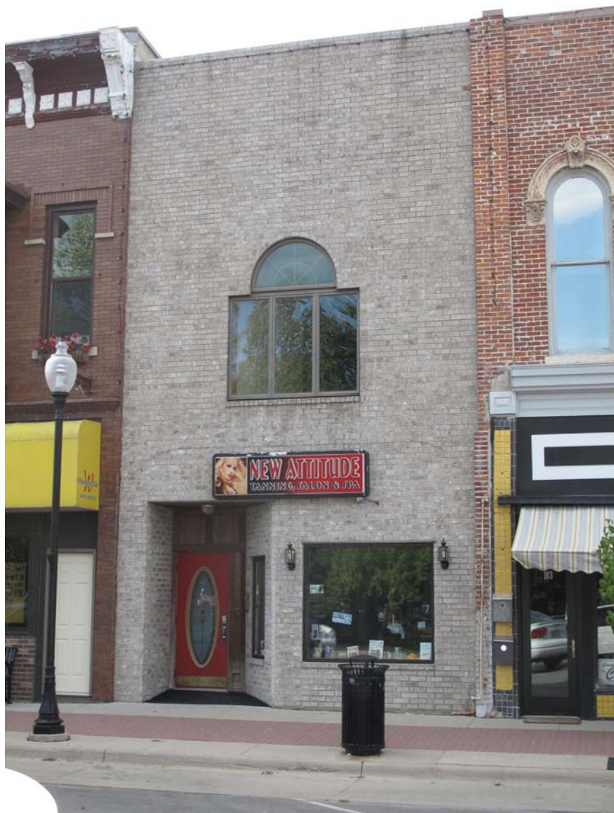
Photograph 92-00559-001 - East elevation, looking west