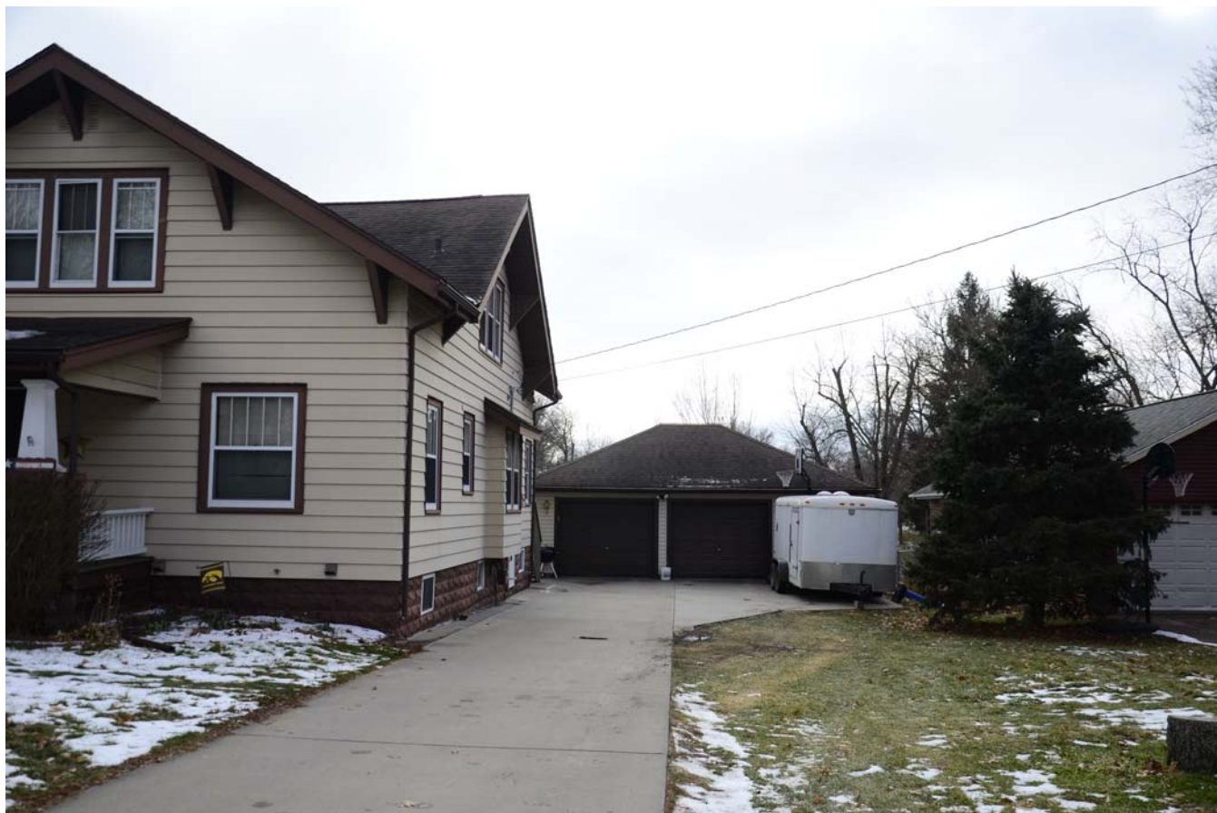
Photograph 92-00790-003 - House, looking south (December 2014)