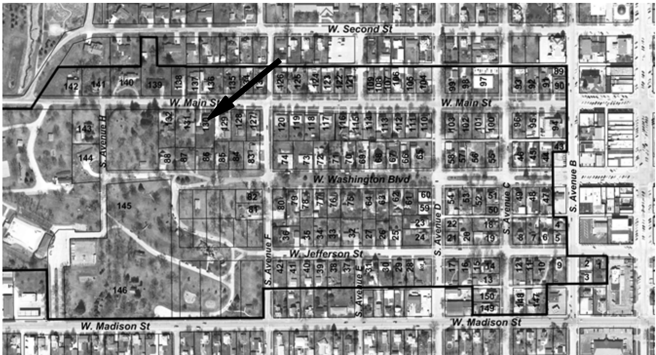
2009 aerial photograph (Washington County) – line indicates survey/research area boundary