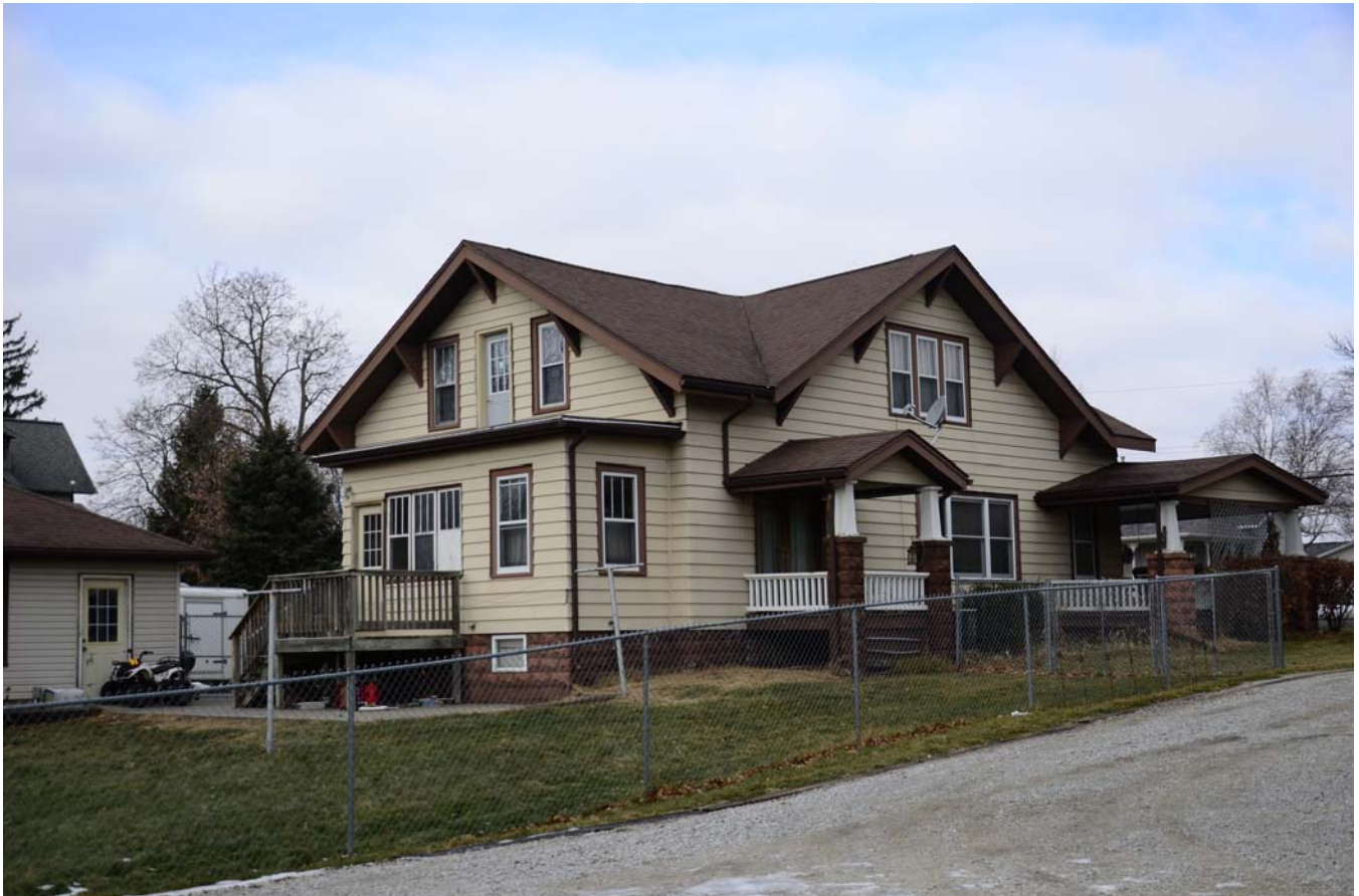
Photograph 92-00790-002 - House, looking northwest (December 2014)