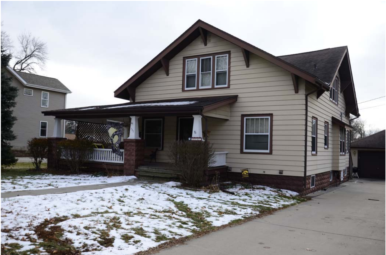
Photograph 92-00790-001 - House, looking southeast (December 2014)