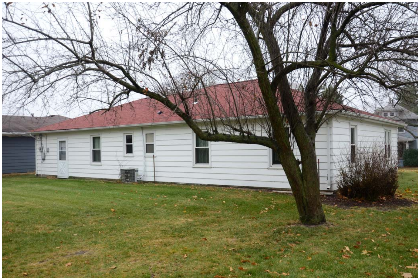
Photograph 92-00742-002 - House, looking southeast (December 2014)