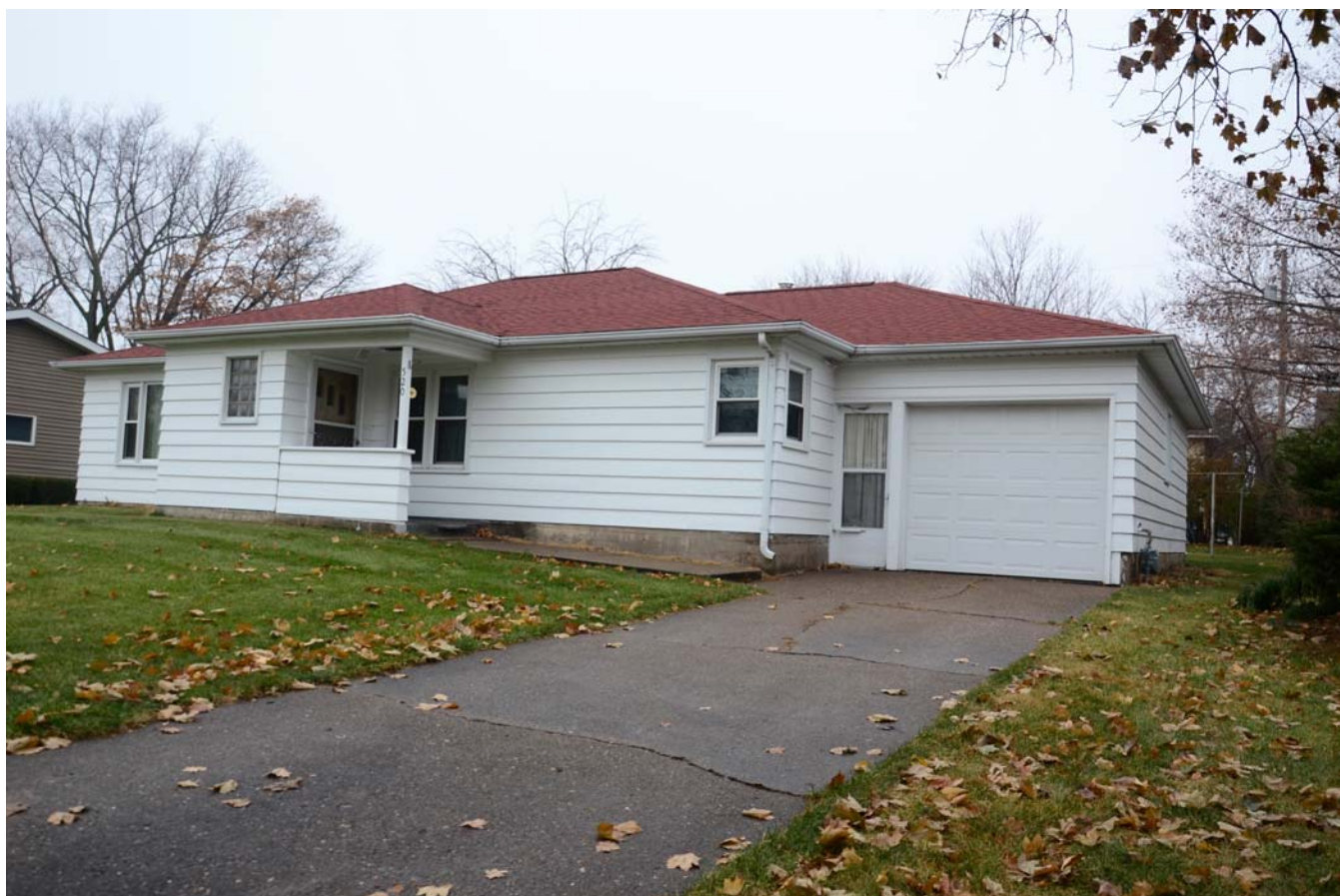
Photograph 92-00741-001 - House, looking northwest (December 2014)