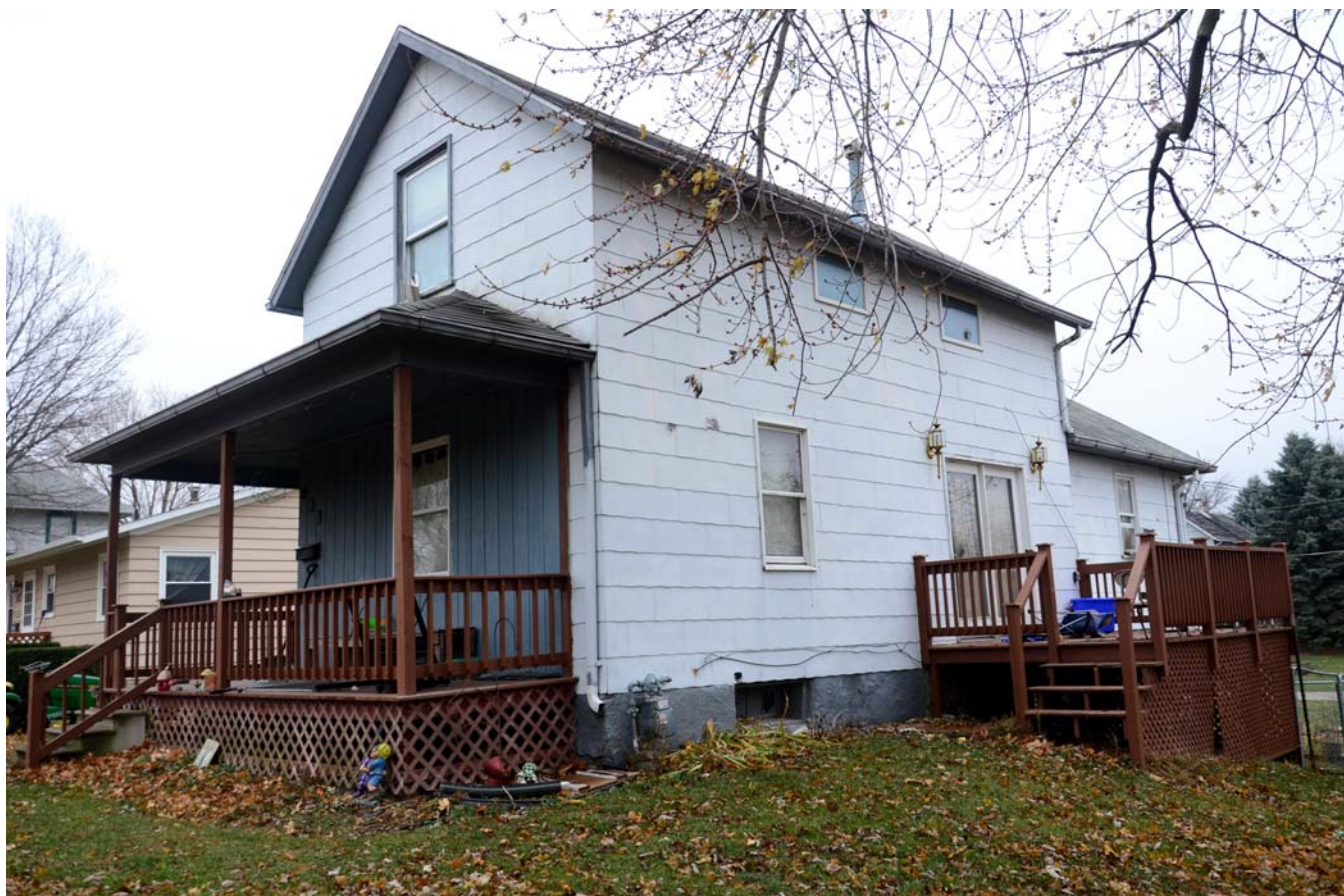
Photograph 92-00756-002 - House, looking southeast (December 2014)