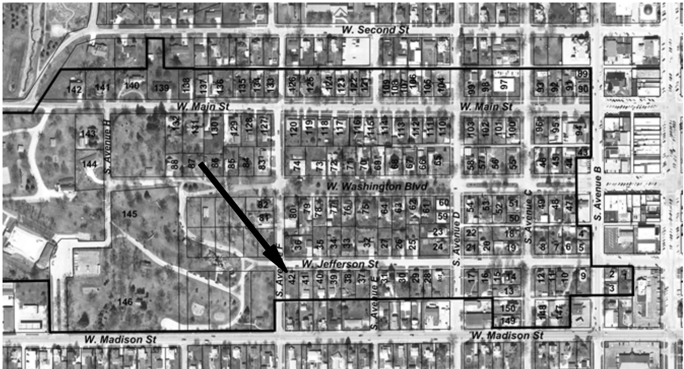
2009 aerial photograph (Washington County) – line indicates survey/research area boundary