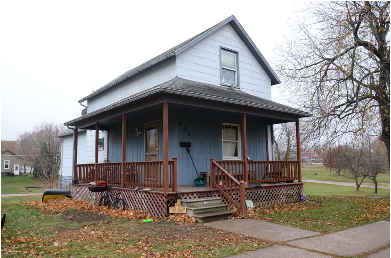
Photograph 92-00756-001 - House, looking southwest (December 2014)