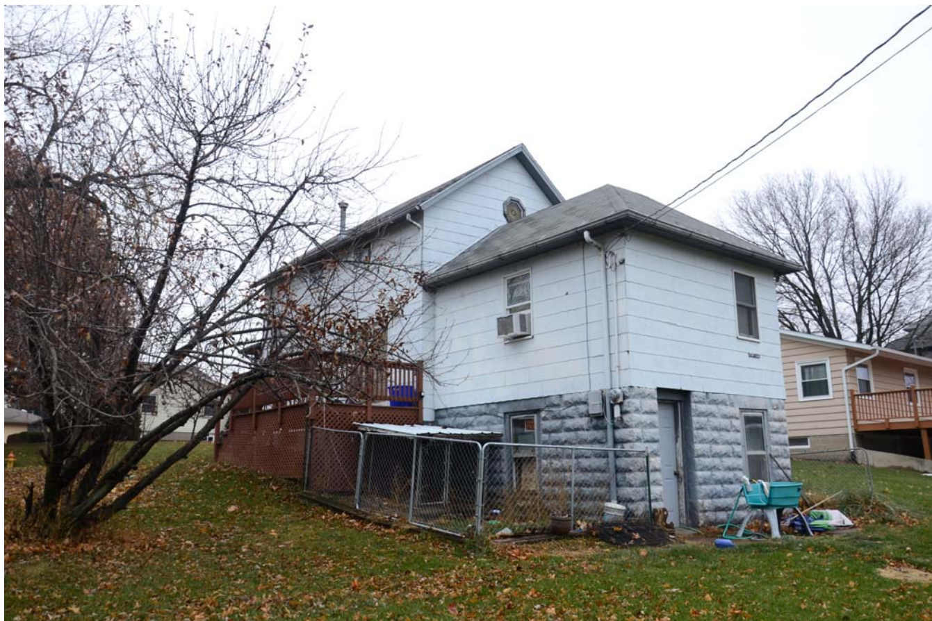
Photograph 92-00756-003 - House, looking northeast (December 2014)