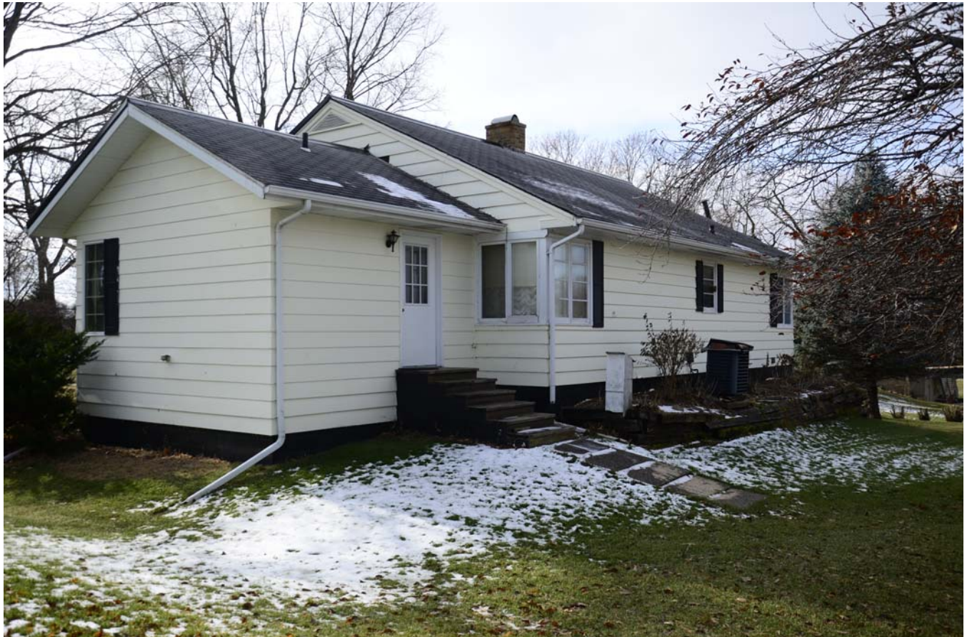
Photograph 92-00800-003 - House, looking southwest (December 2014)