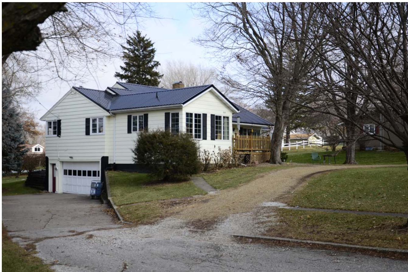
Photograph 92-00800-002 - House, looking northeast (December 2014)