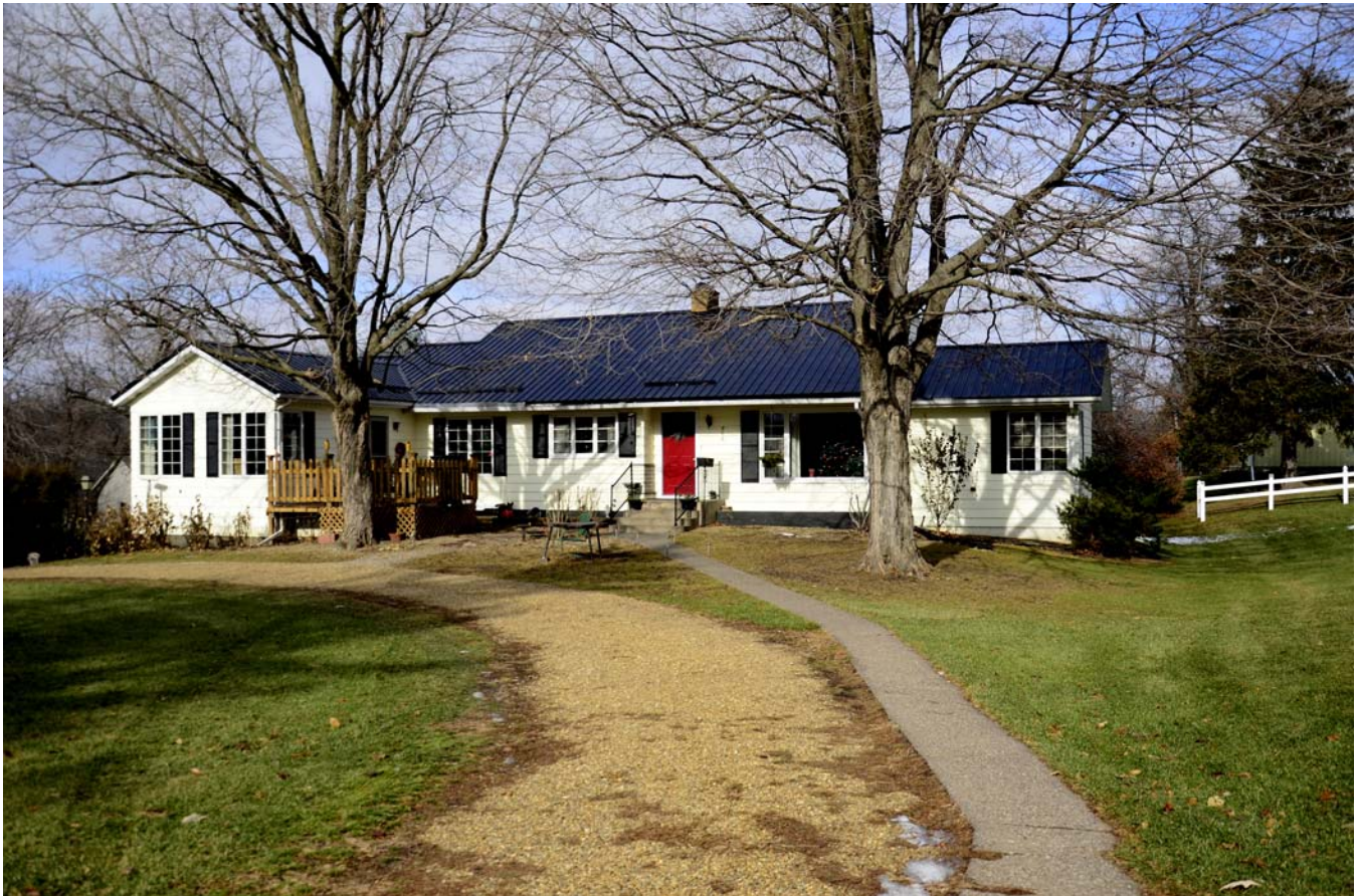
Photograph 92-00800-001 - House, looking northwest (December 2014)