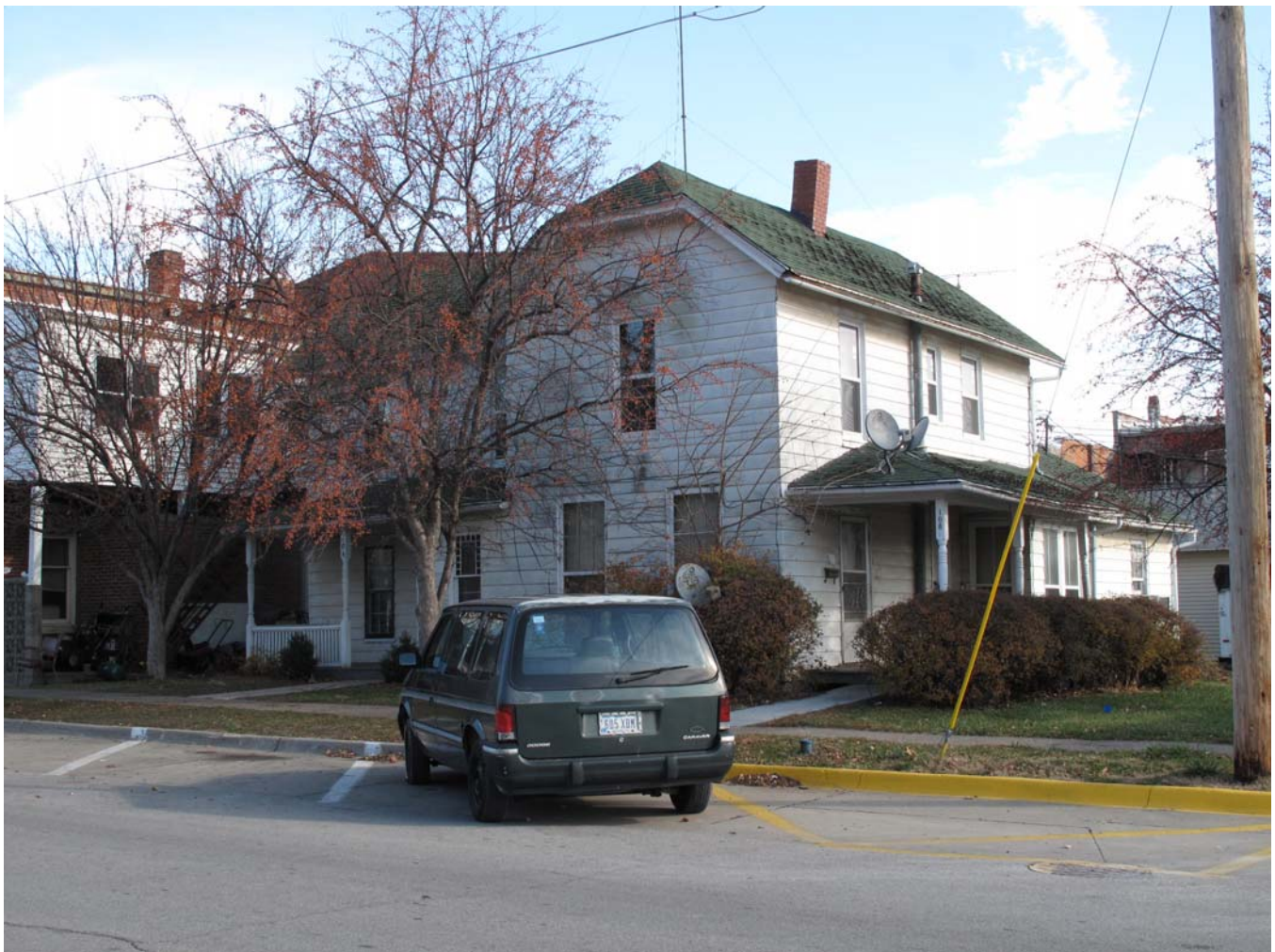
Photograph 92-00496-001 - West and south elevations, looking northeast