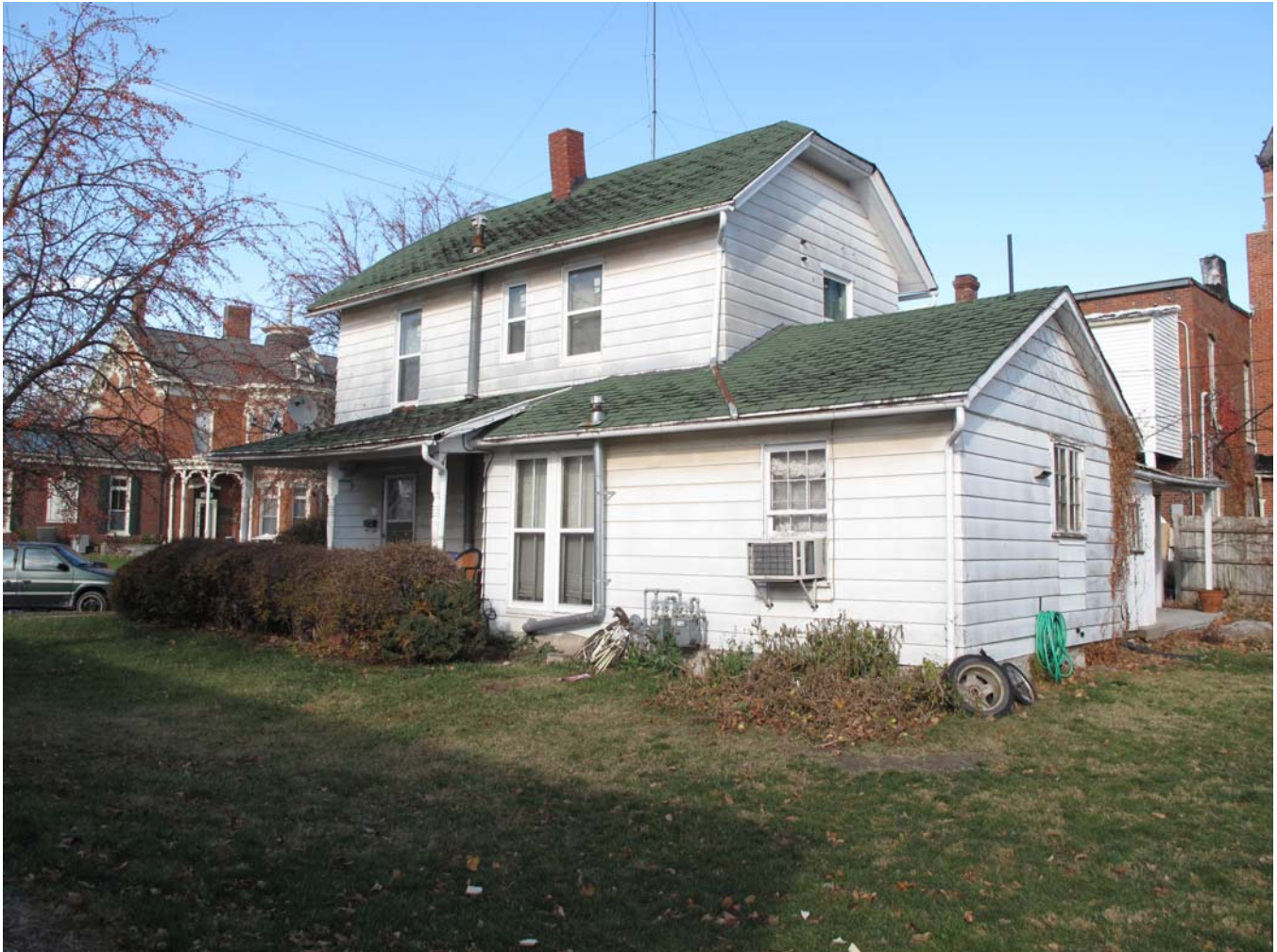
Photograph 92-00496-003 - South and east elevations, looking northwest