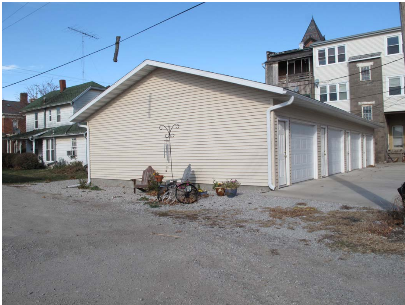
Photograph 92-00496-004 - Garage, looking northwest (, November 15, 2011)