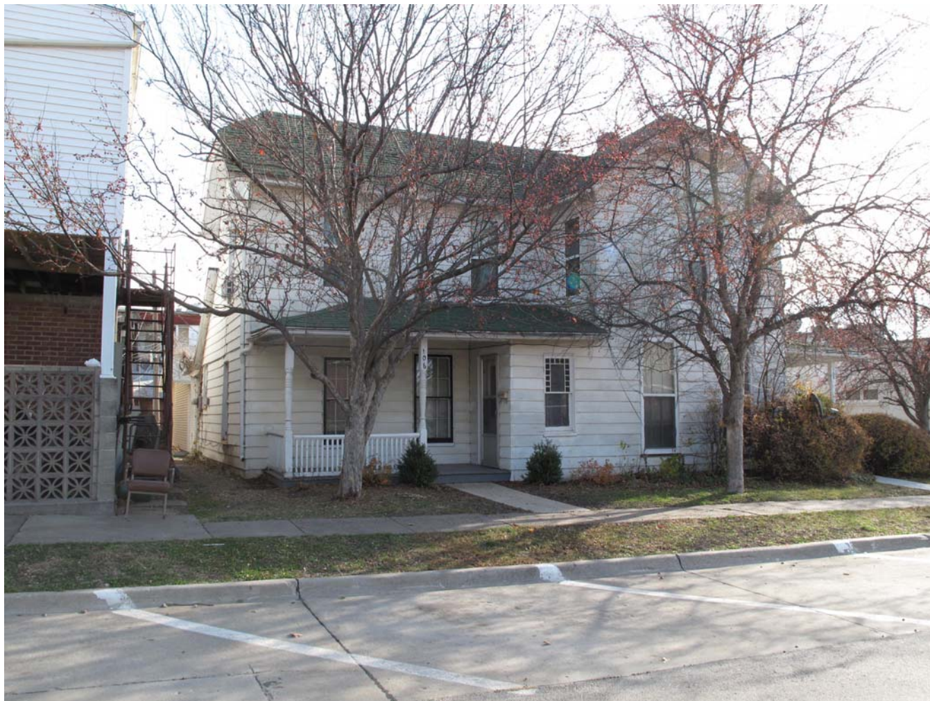
Photograph 92-00496-002 - West elevation, looking southeast