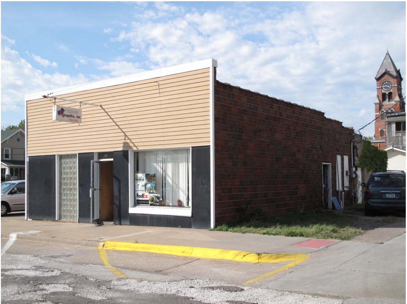
Photograph 92-00613-002 - South and east elevations, looking northwest (, September 20, 2011)