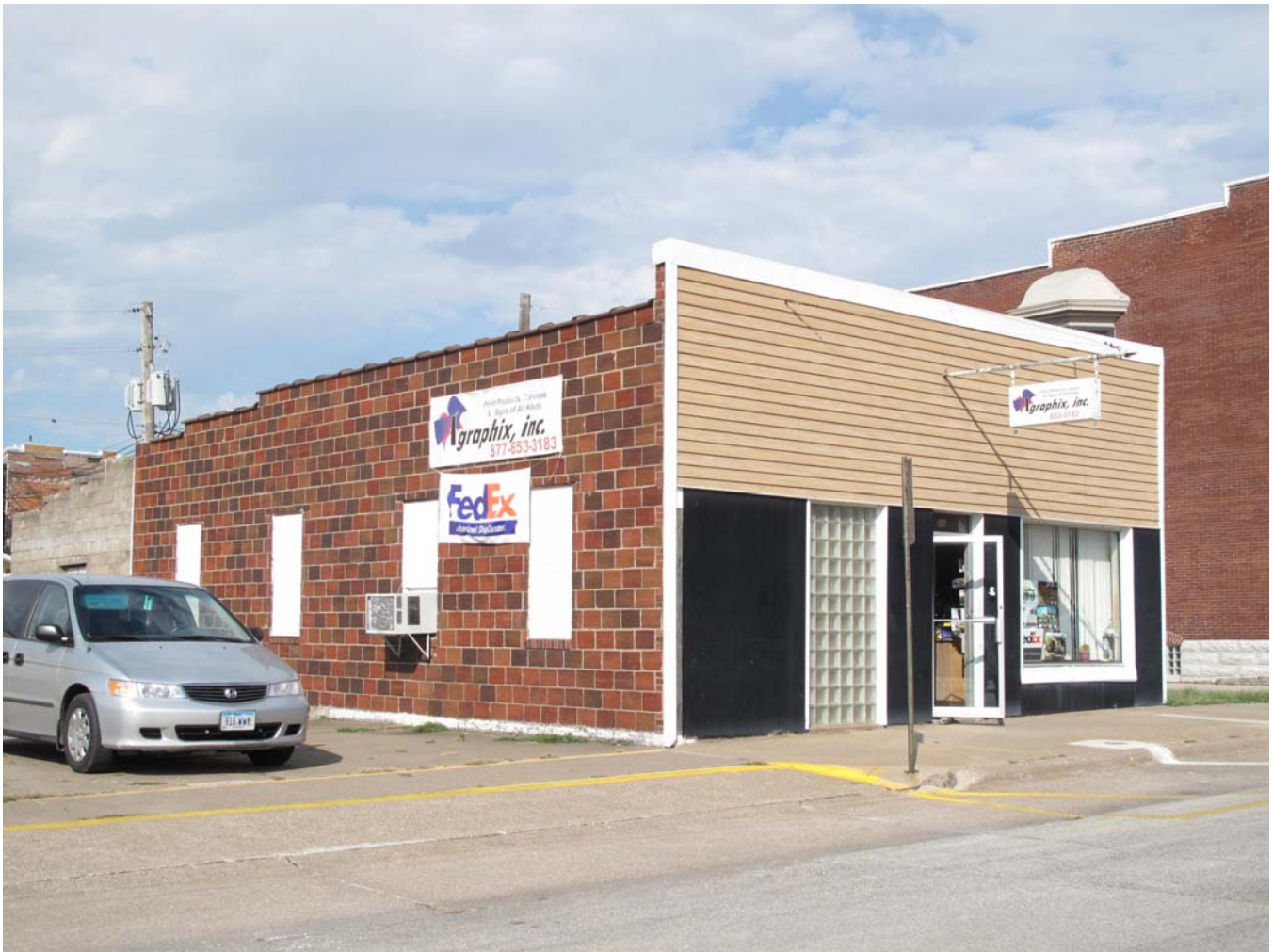
Photograph 92-00613-001 - West and south elevations, looking northeast