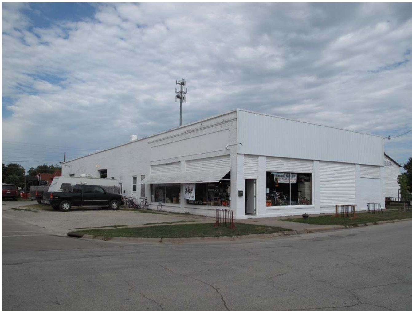
Photograph 92-00587-001 - West and south elevations, looking northeast