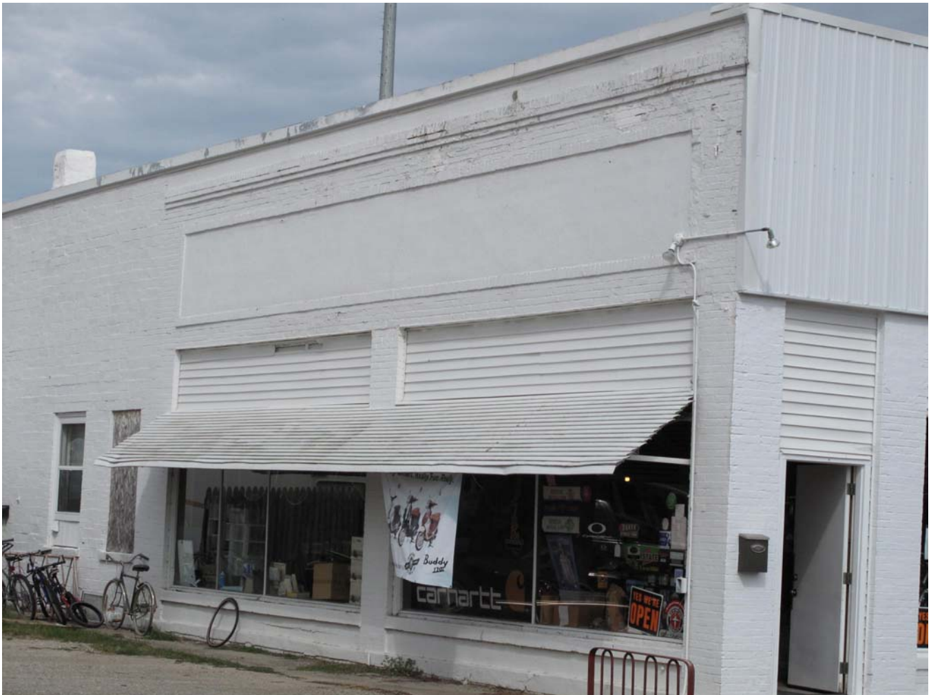
Photograph 92-00587-002 - Detail of brick on west elevation, looking northeast