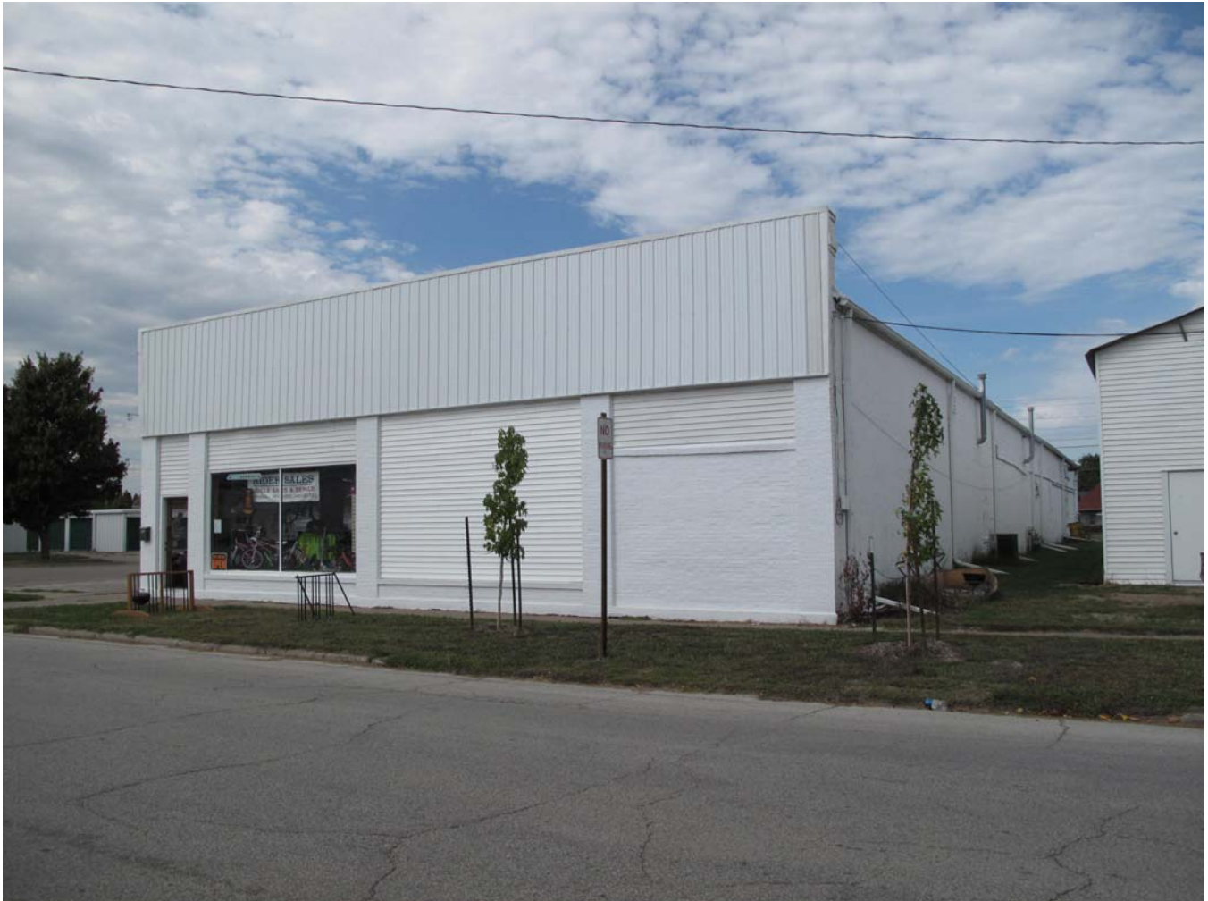
Photograph 92-00587-003 - South and east elevations, looking northwest