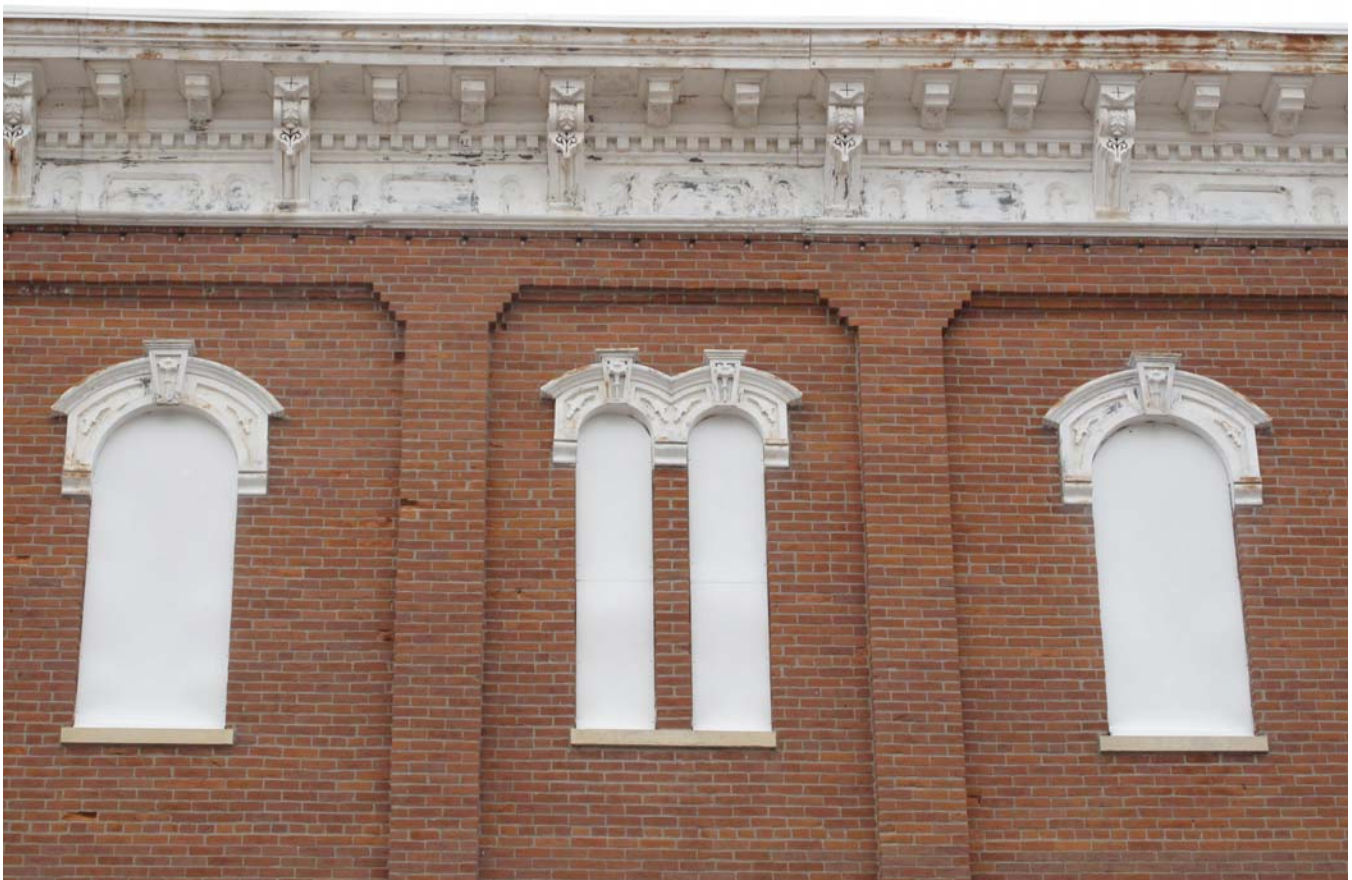
Photograph 92-00502-003 - Detail on east elevation, looking west (, September 20, 2011)