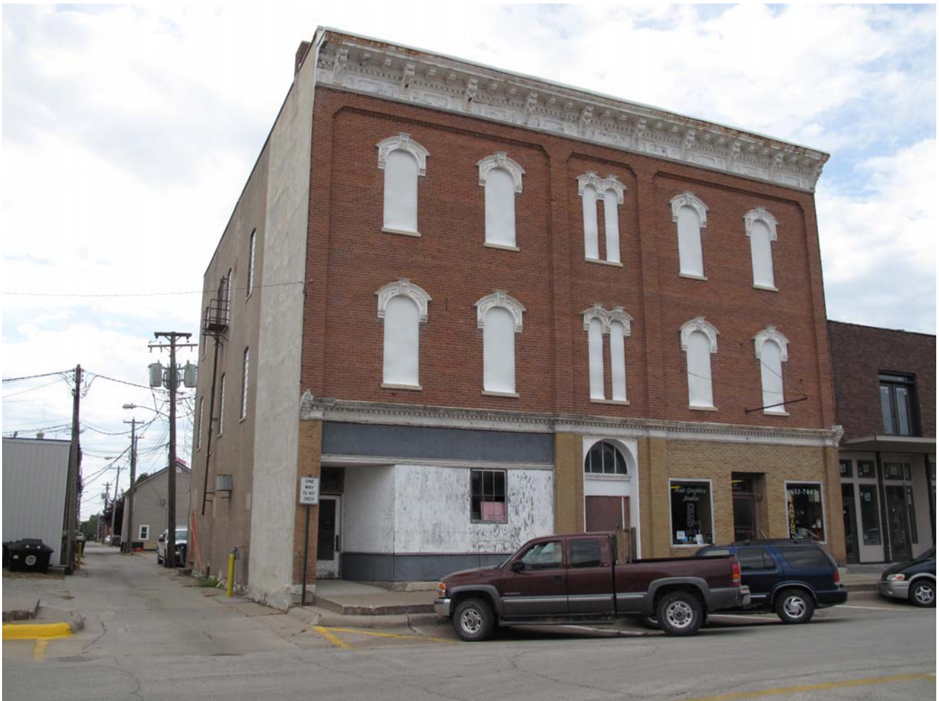
Photograph 92-00502-001 - East elevation, looking northwest (, September 20, 2011)