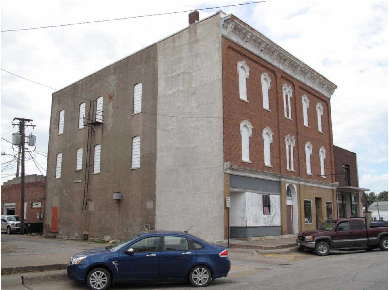
Photograph 92-00502-004 - South elevation, looking northwest