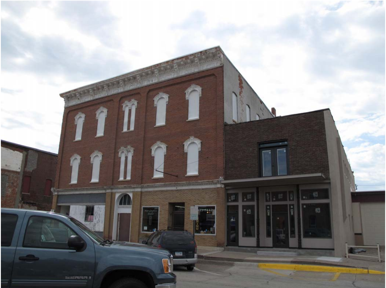
Photograph 92-00502-005 - East and north elevations, looking southwest