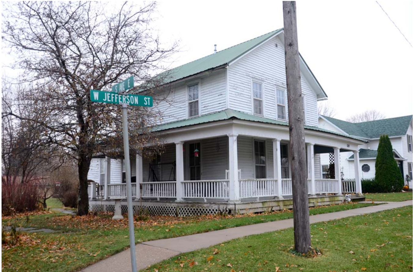
Photograph 92-00751-002 - House, looking southwest (December 2014)