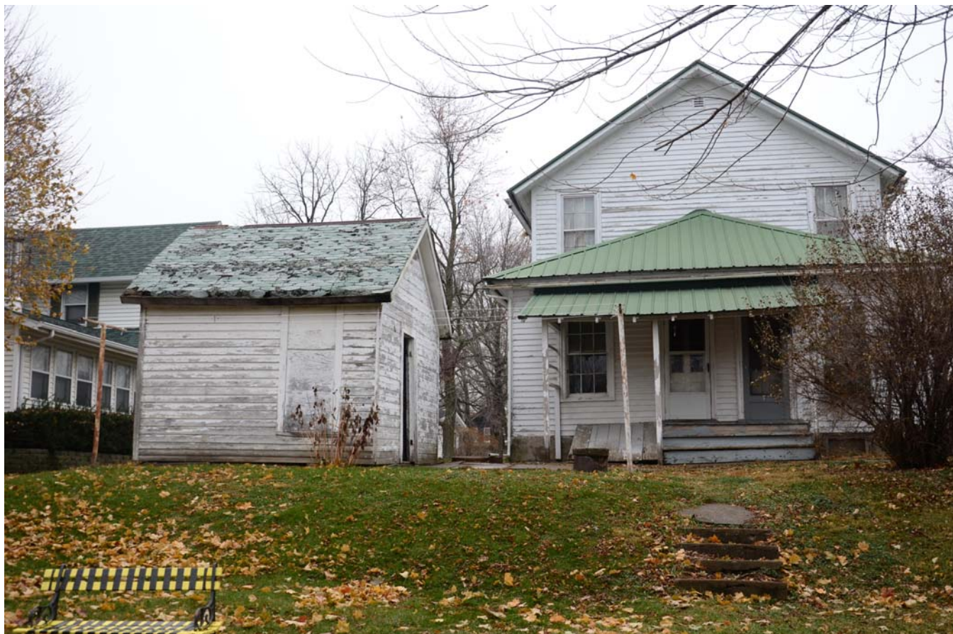
Photograph 92-00751-004 - House and shed, looking north (December 2014)