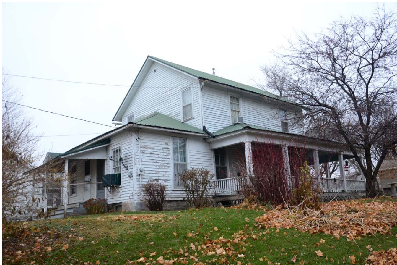
Photograph 92-00751-003 - House, looking northwest (December 2014)