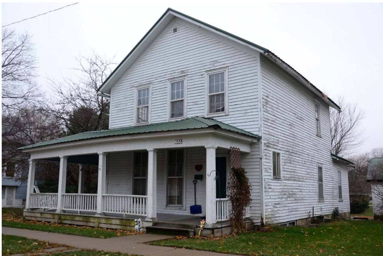
Photograph 92-00751-001 - House, looking southeast (December 2014)