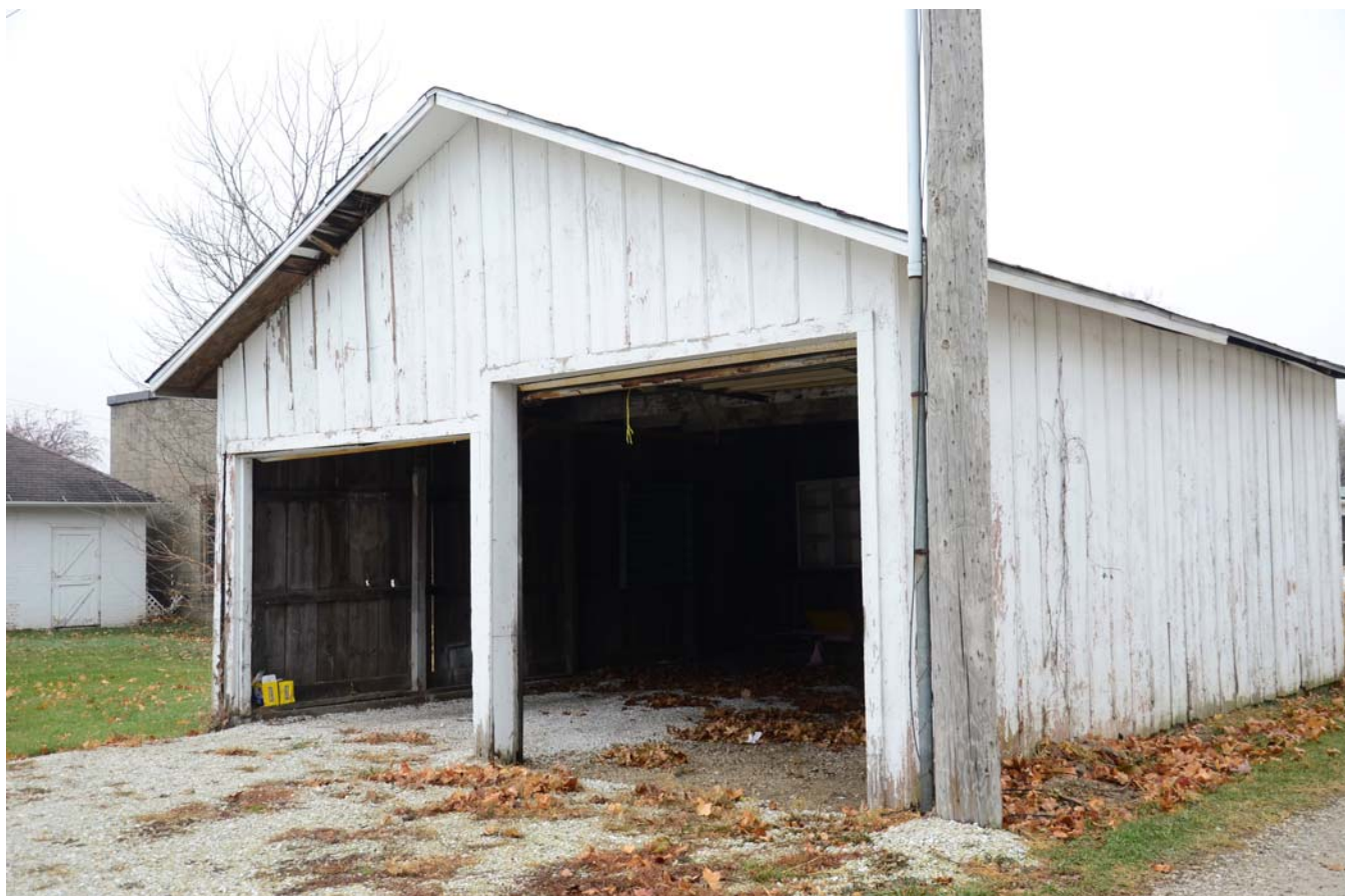
Photograph 92-00428-004 - Garage, looking southwest (December 2014)