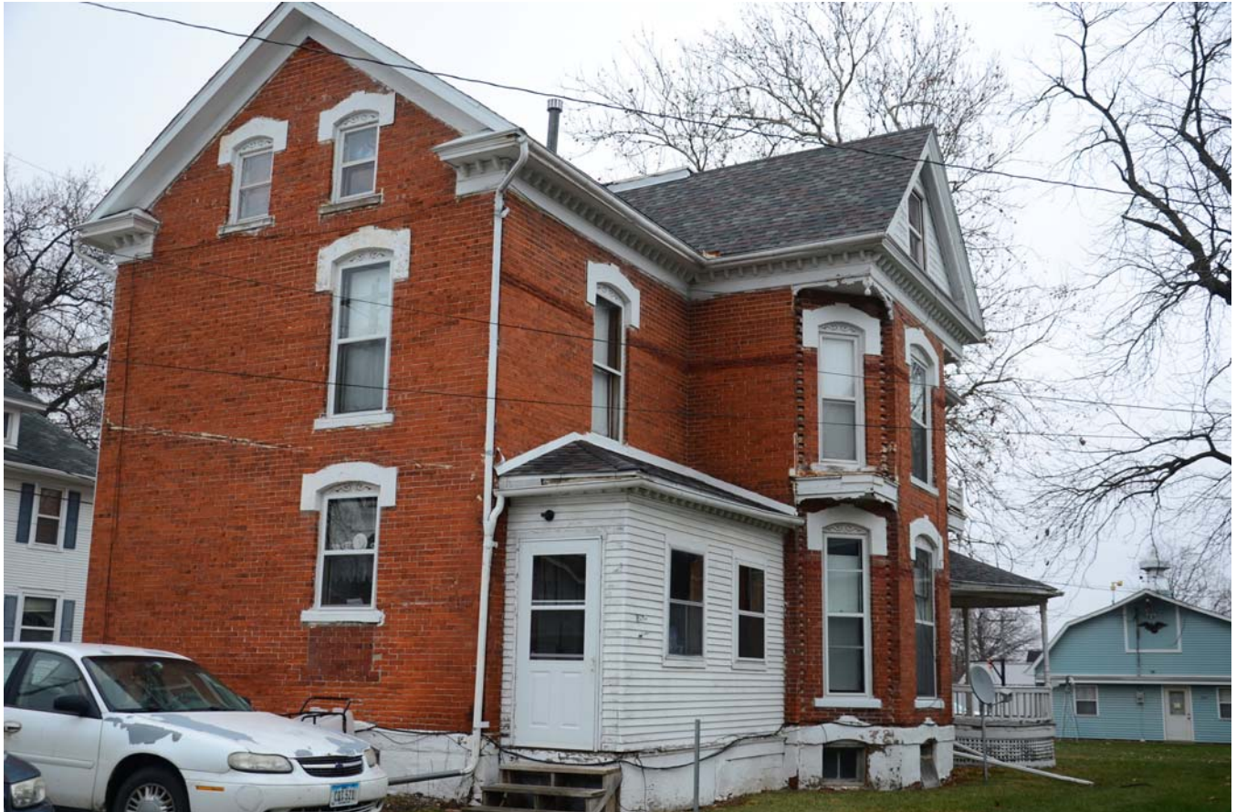
Photograph 92-00428-003 - House, looking northeast (December 2014)