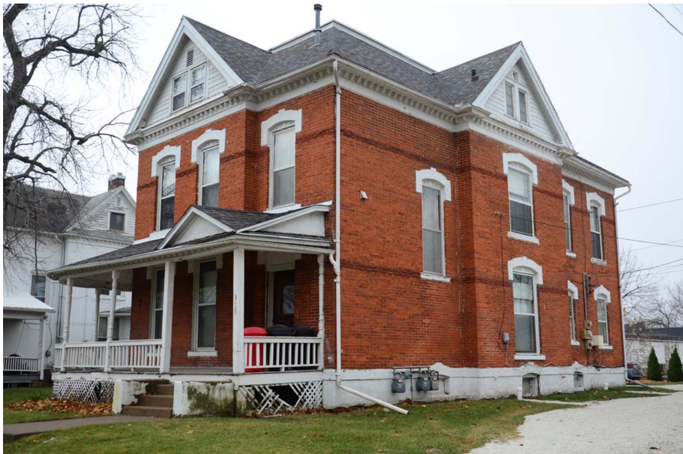
Photograph 92-00428-002 - House, looking southwest (December 2014)