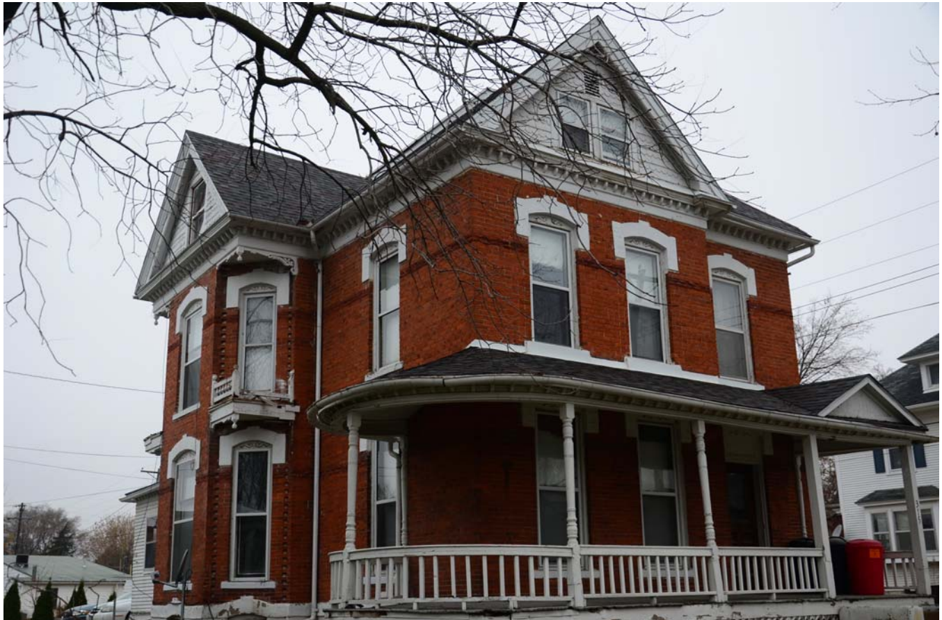
Photograph 92-00428-001 - House, looking northwest (December 2014)