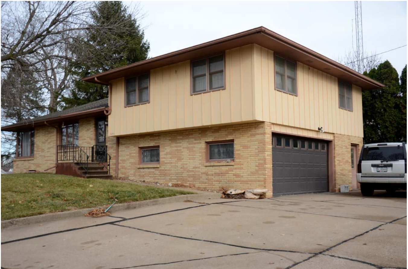
Photograph 92-00764-003 - House, looking southeast (December 2014)