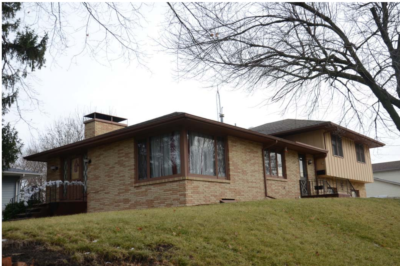
Photograph 92-00764-002 - House, looking southeast (December 2014)