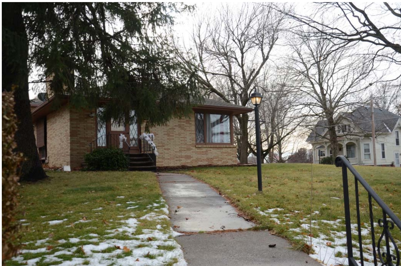
Photograph 92-00764-001 - House, looking south (December 2014)