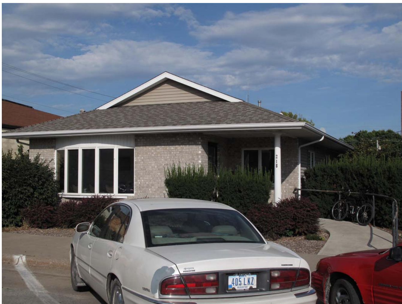
Photograph 92-00524-001 - West and south elevations, looking northeast (, September 20, 2011)