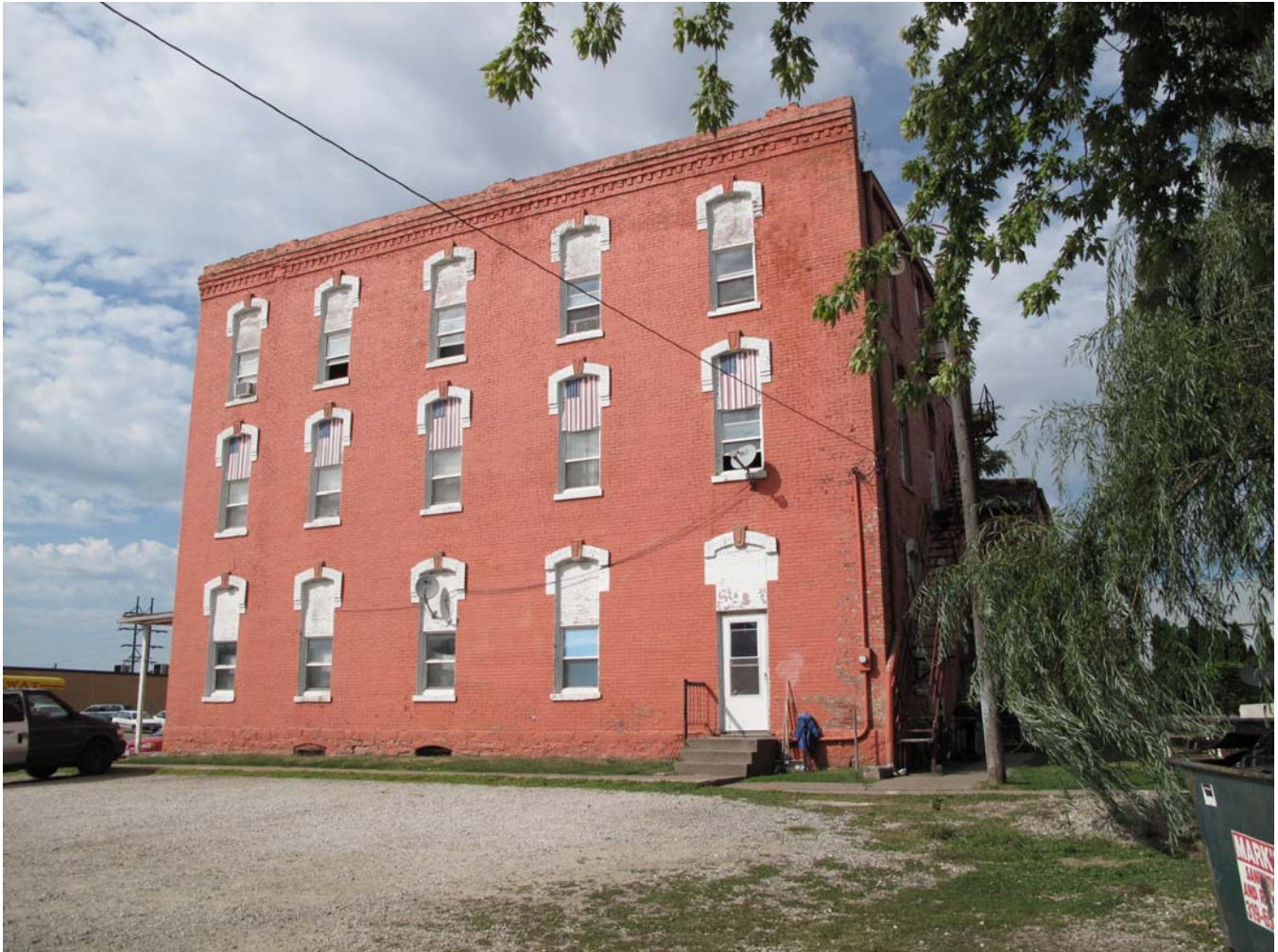
Photograph 92-00664-002 - South elevation, looking northwest