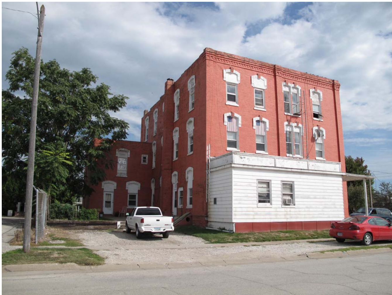
Photograph 92-00664-003 - North and west elevations, looking southeast