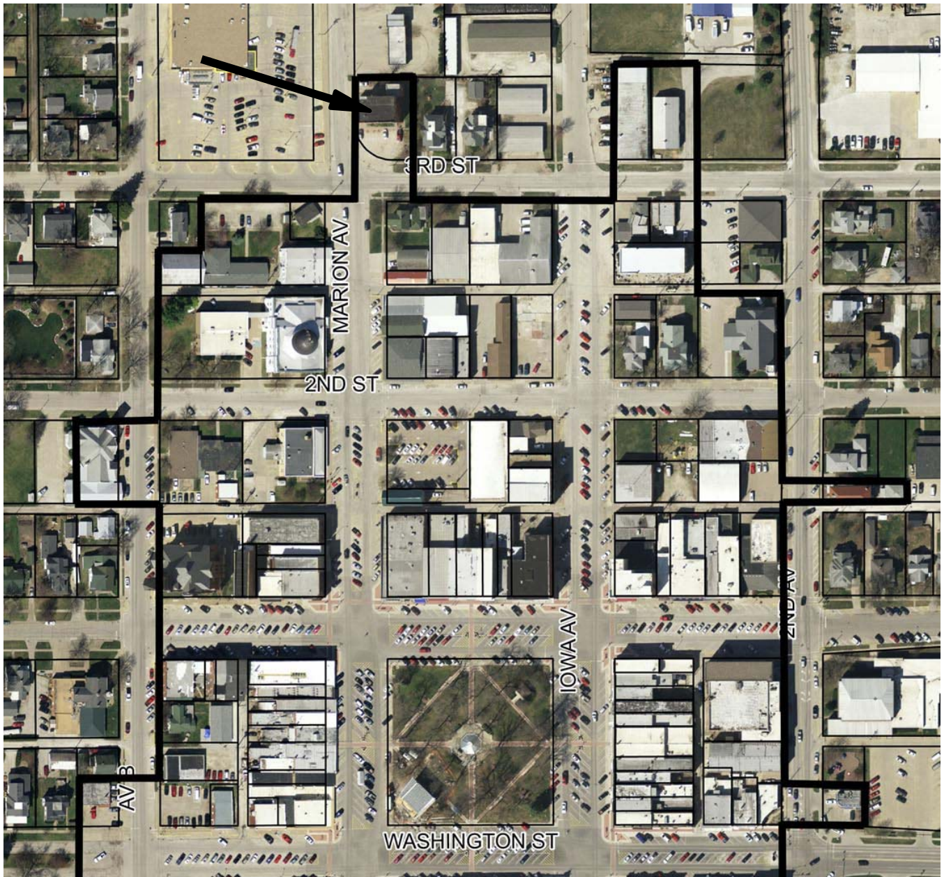
2009 aerial photograph (Washington County) – line indicates survey/research area boundary