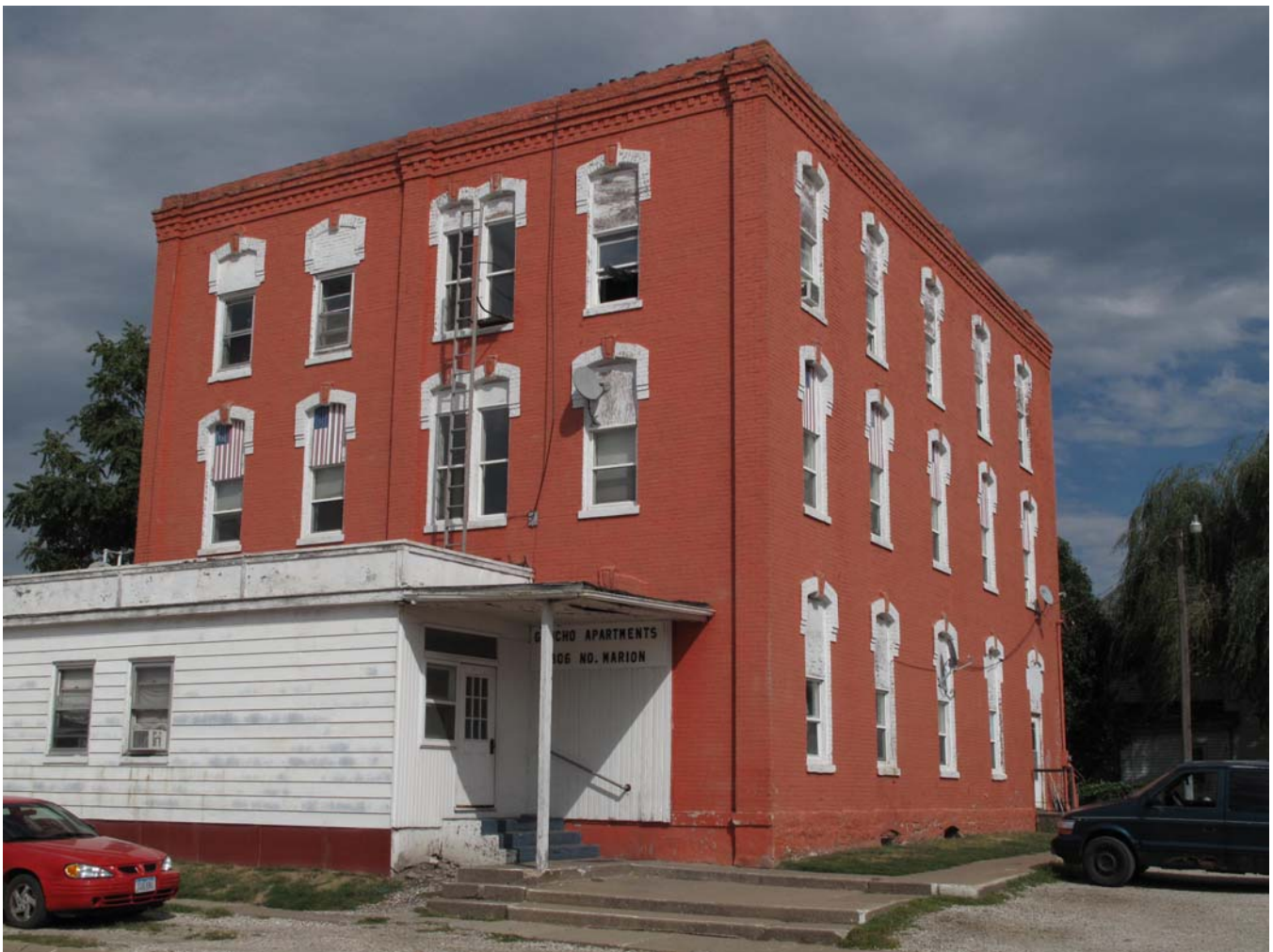
Photograph 92-00664-001 - West and south elevations, looking northeast (, September 20, 2011)