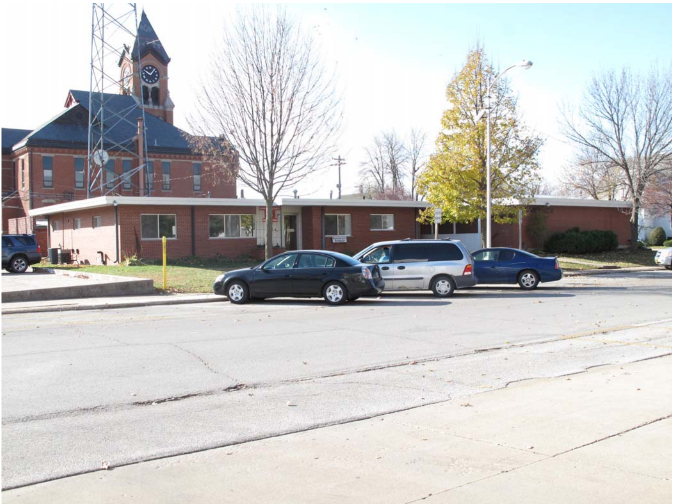
Photograph 92-00585-001 - East and north elevations, looking southwest.