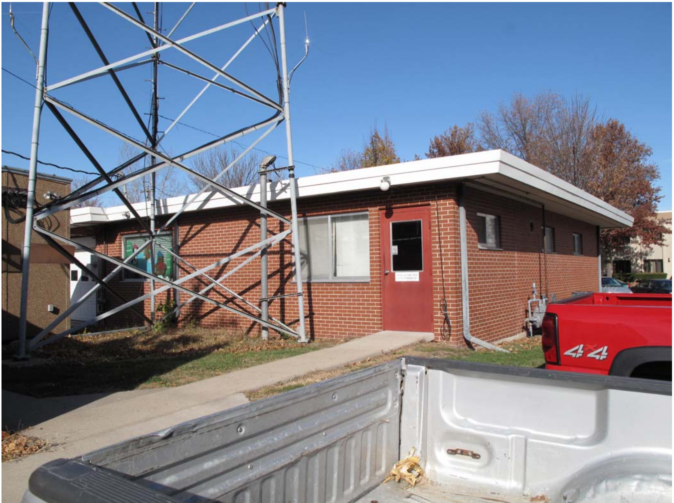
Photograph 92-00585-007 - South elevation of east section, looking northwest.