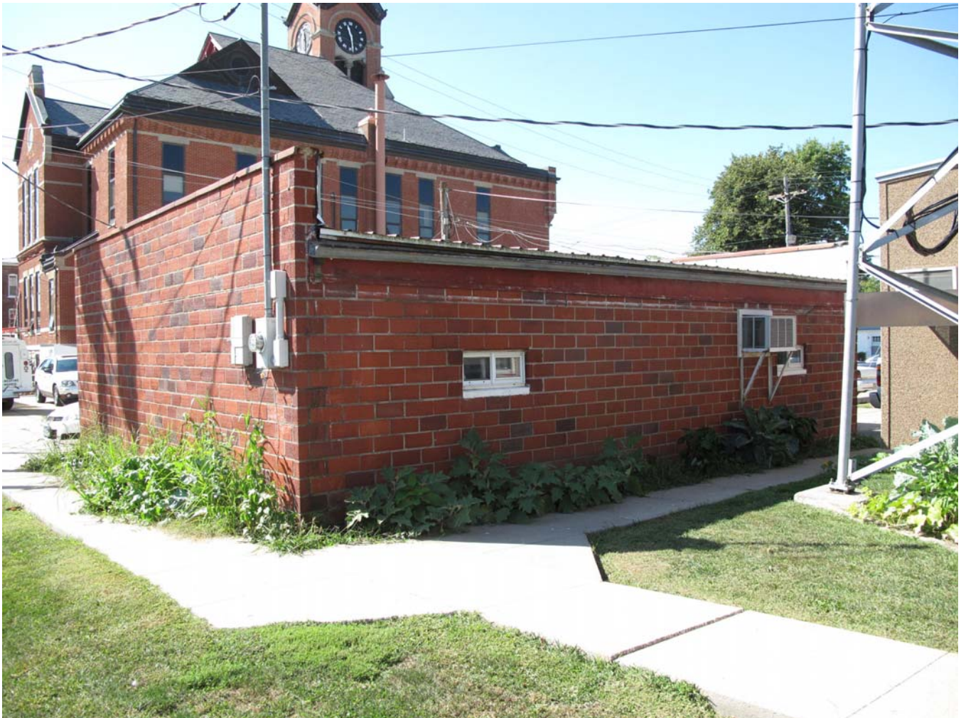
Photograph 92-00585-009 - Tile block garage, looking southwest.