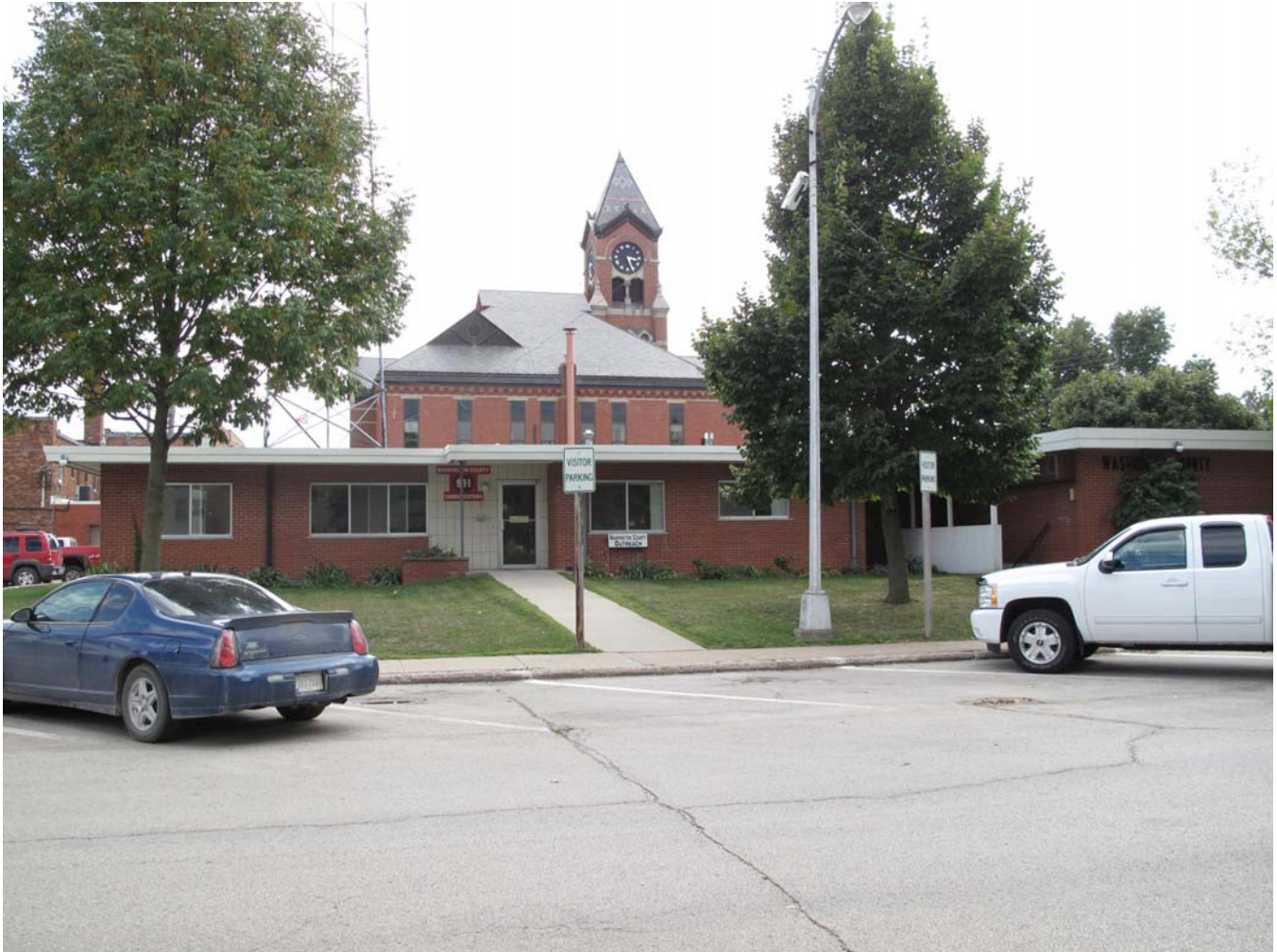
Photograph 92-00585-002 - North elevation, looking south.