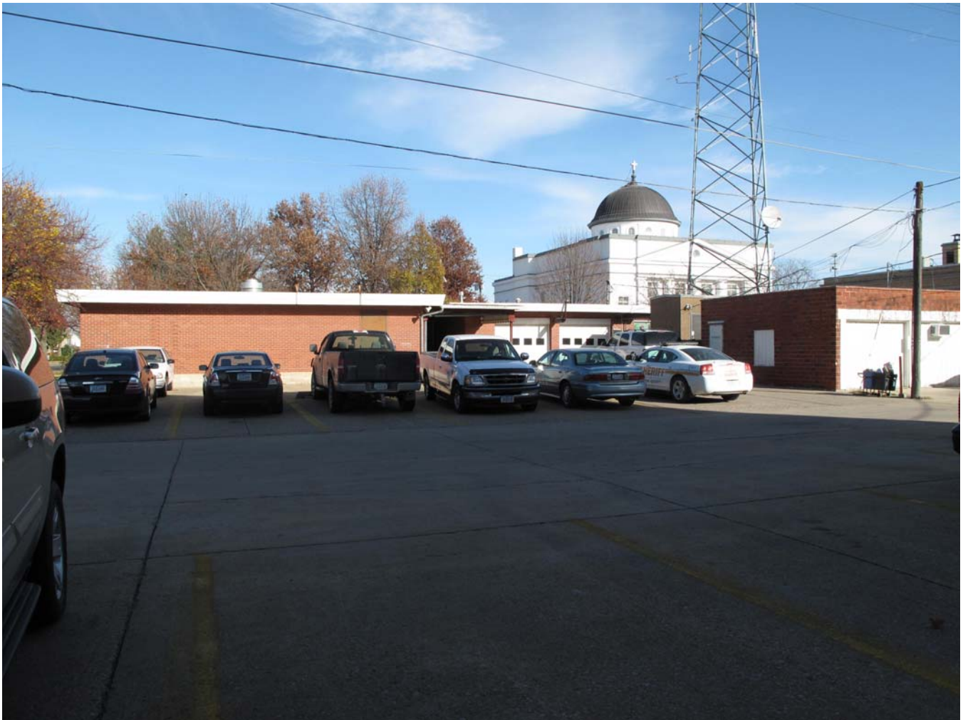
Photograph 92-00585-006 - South elevation with garage at right, looking north.