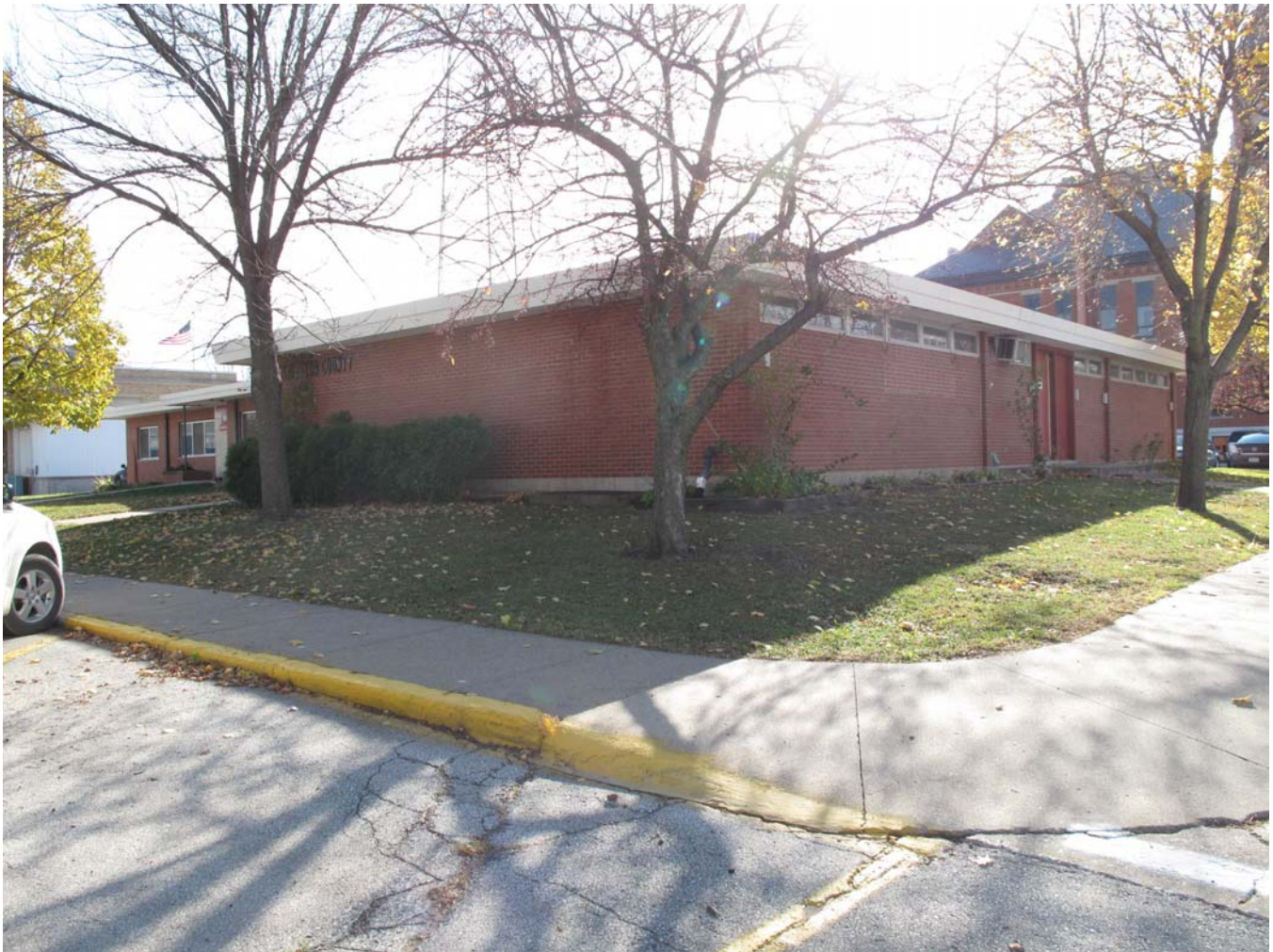
Photograph 92-00585-005 - North and west elevations, looking southeast (, November 15, 2011).