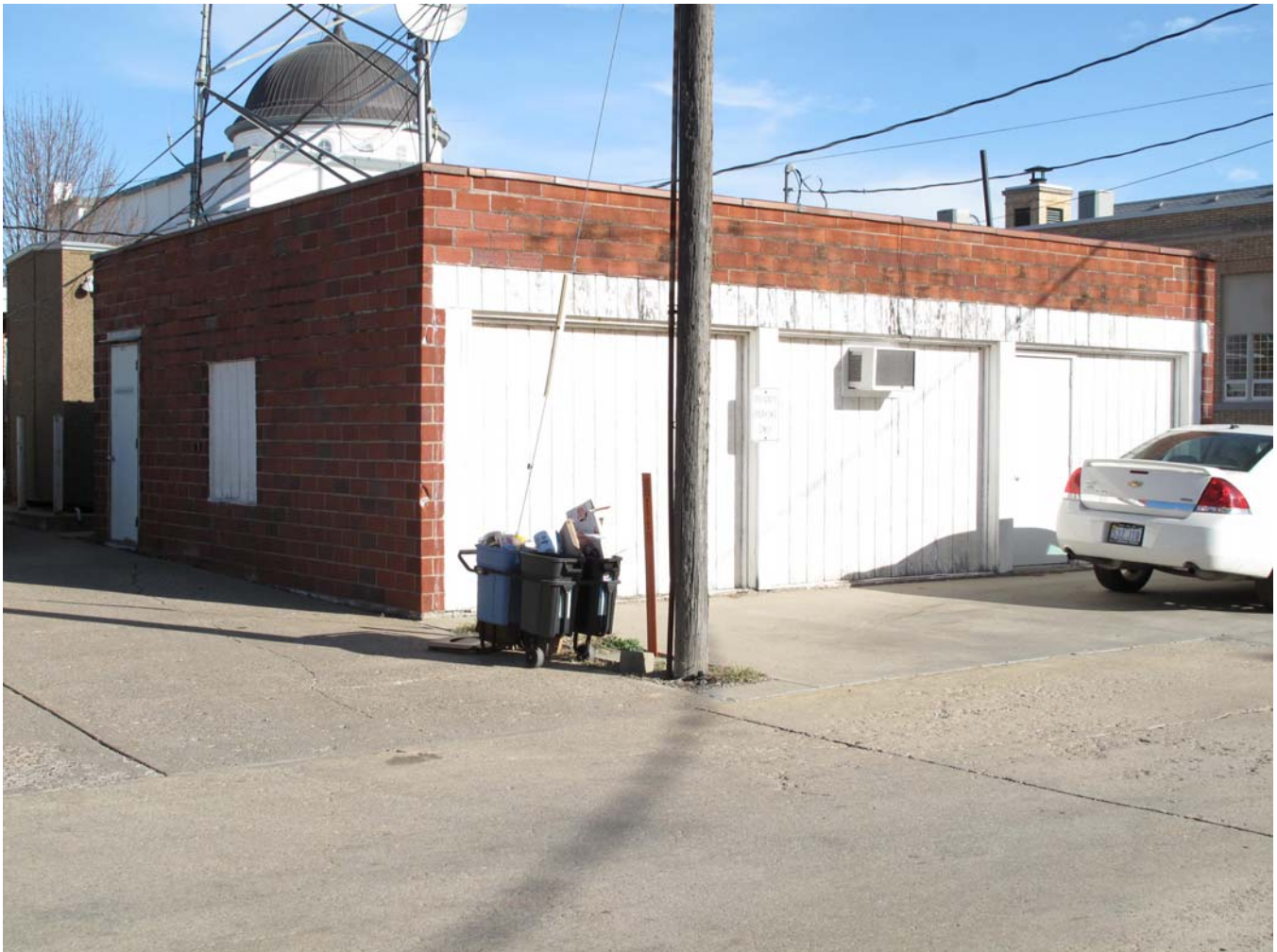
Photograph 92-00585-008 - Tile block garage, looking northeast.