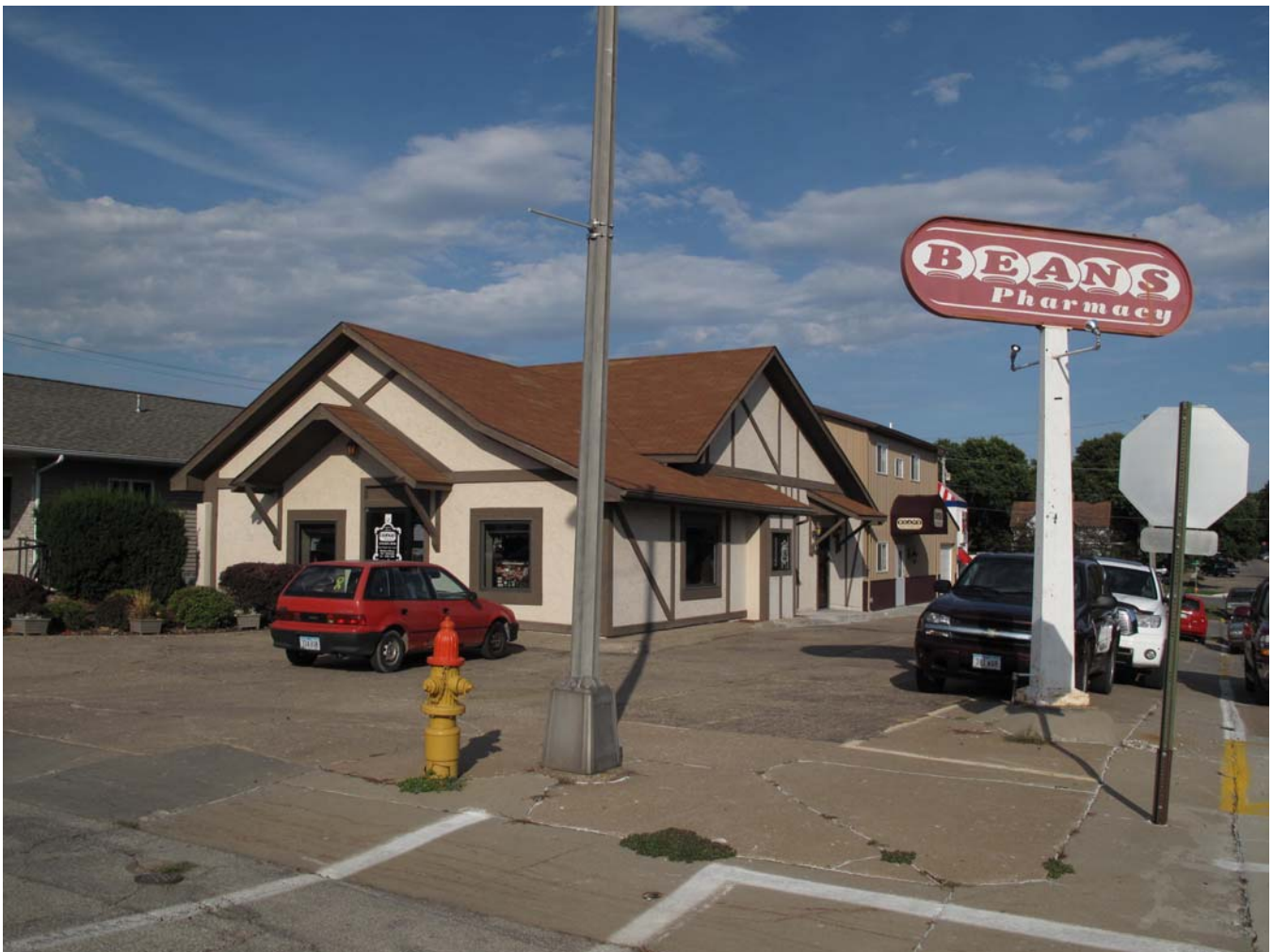
Photograph 92-00528-001 - West and south elevations, looking northeast