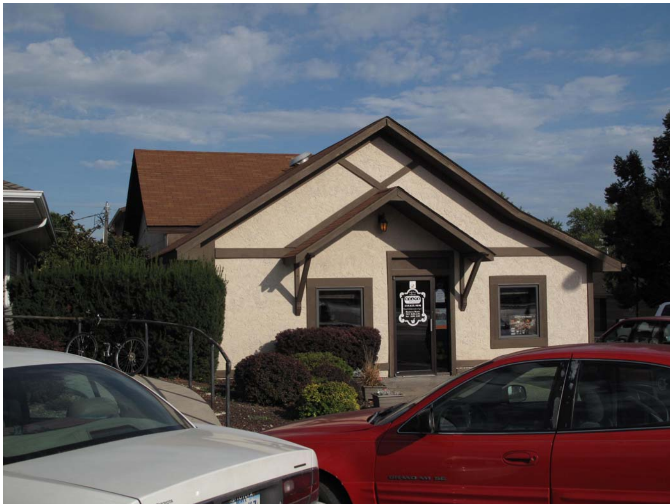
Photograph 92-00528-003 - West elevation, looking east