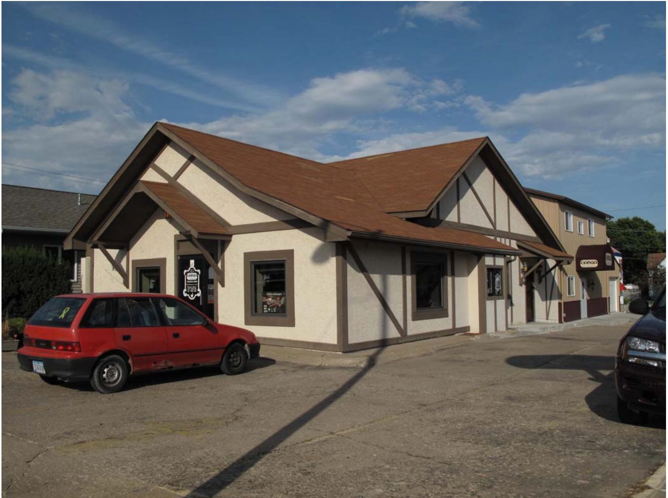
Photograph 92-00528-002 - West and south elevations, looking northeast