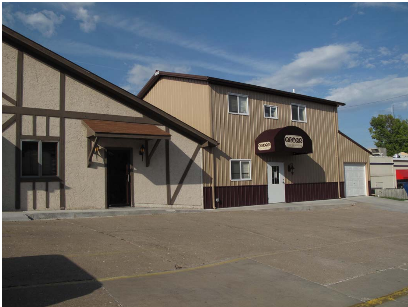
Photograph 92-00528-004 - South side of east addition, looking northeast (, September 20, 2011)