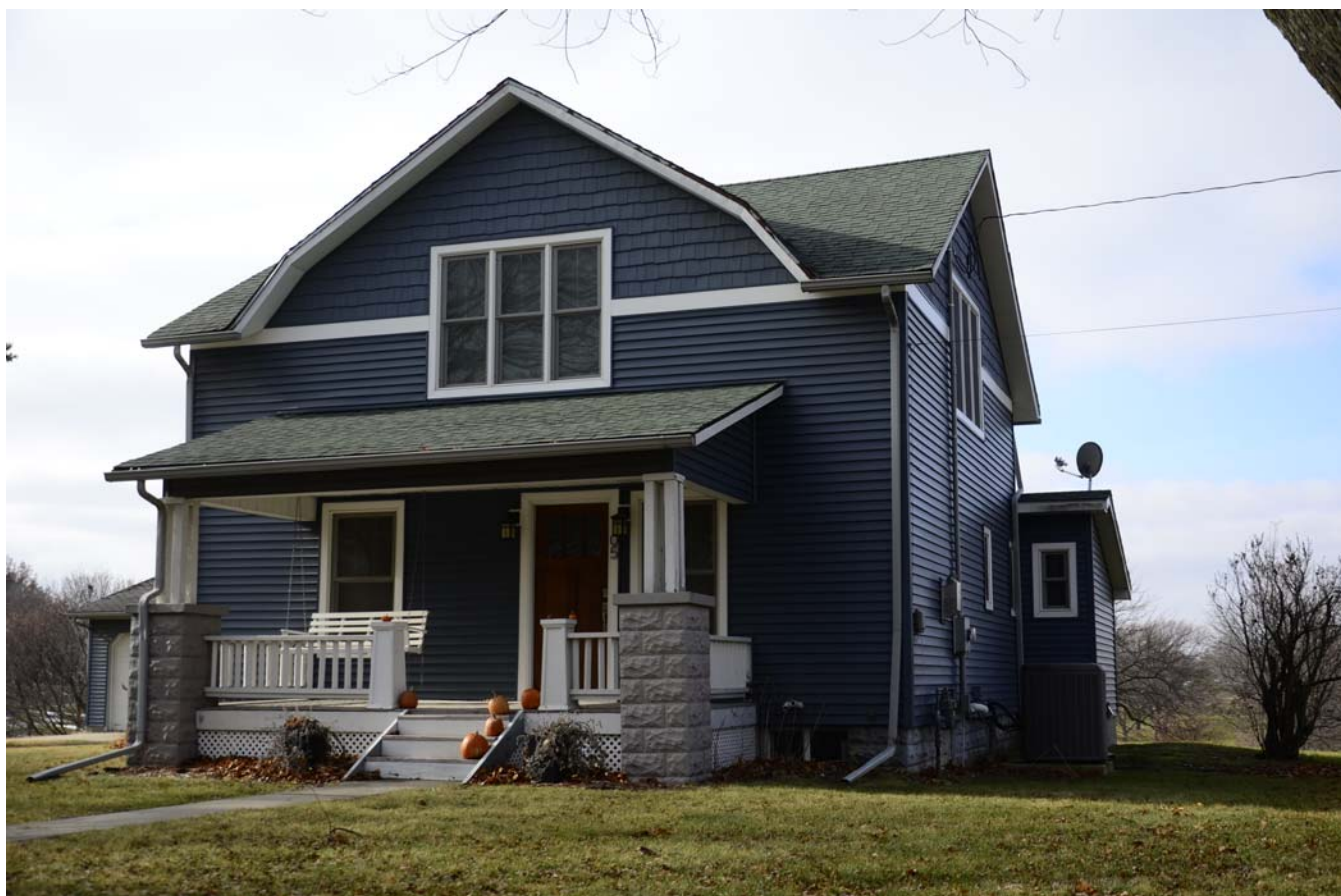
Photograph 92-00803-001 - House, looking southwest (December 2014)