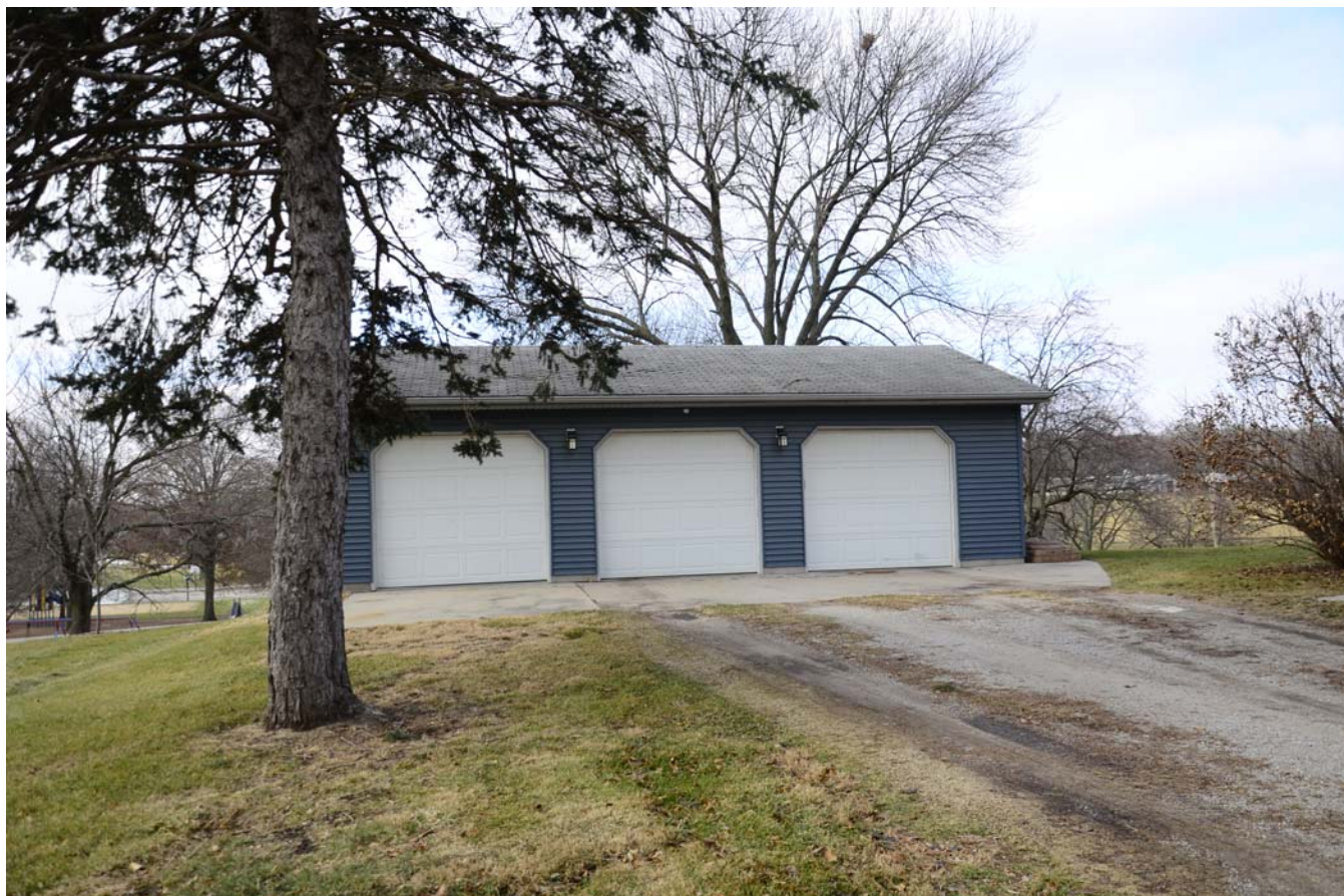
Photograph 92-00803-004 - Garage, looking west (December 2014)