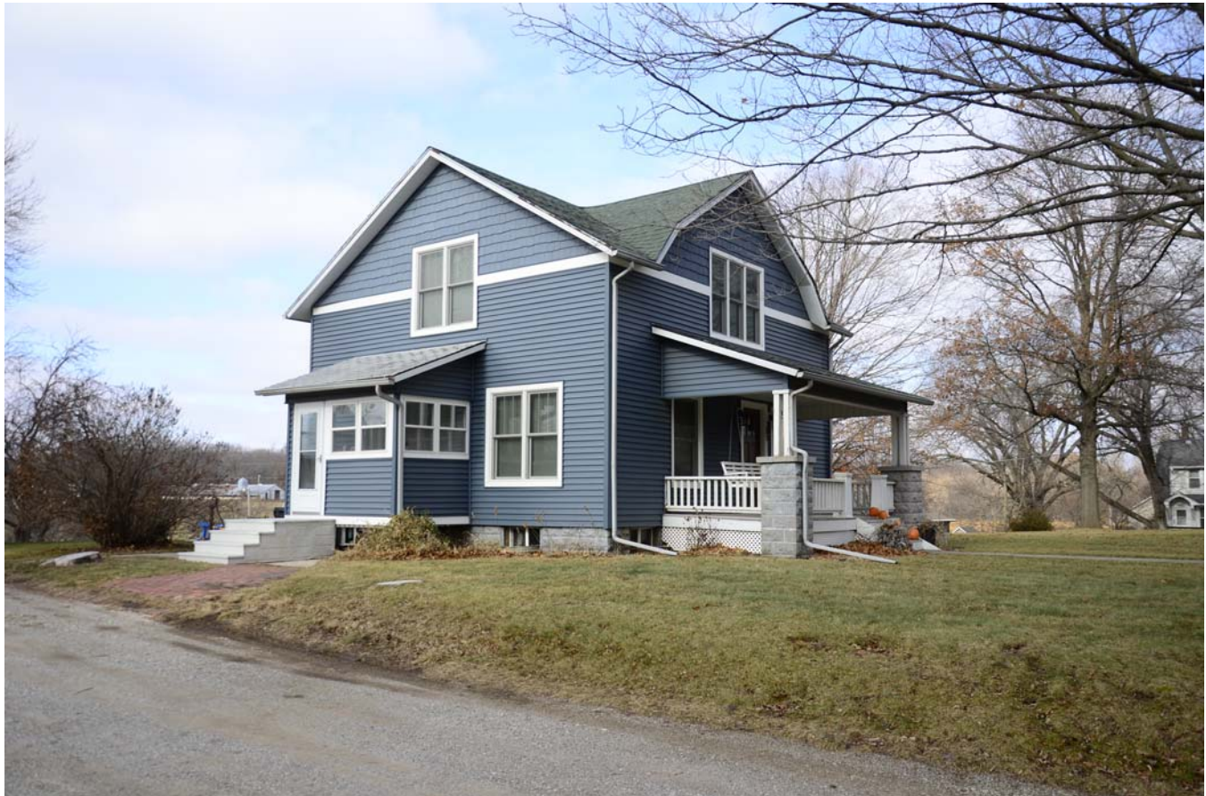
Photograph 92-00803-002 - House, looking northwest (December 2014)