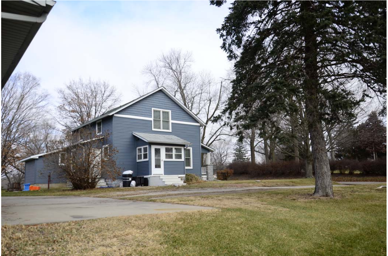
Photograph 92-00803-003 - House, looking northeast (December 2014)