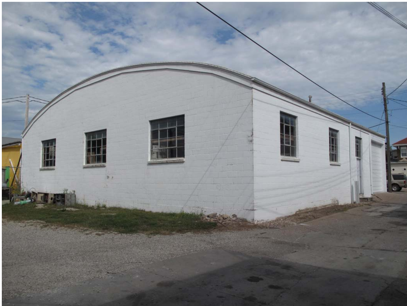
92-00662-002 - West and south elevations, looking northeast (, September 20, 2011)