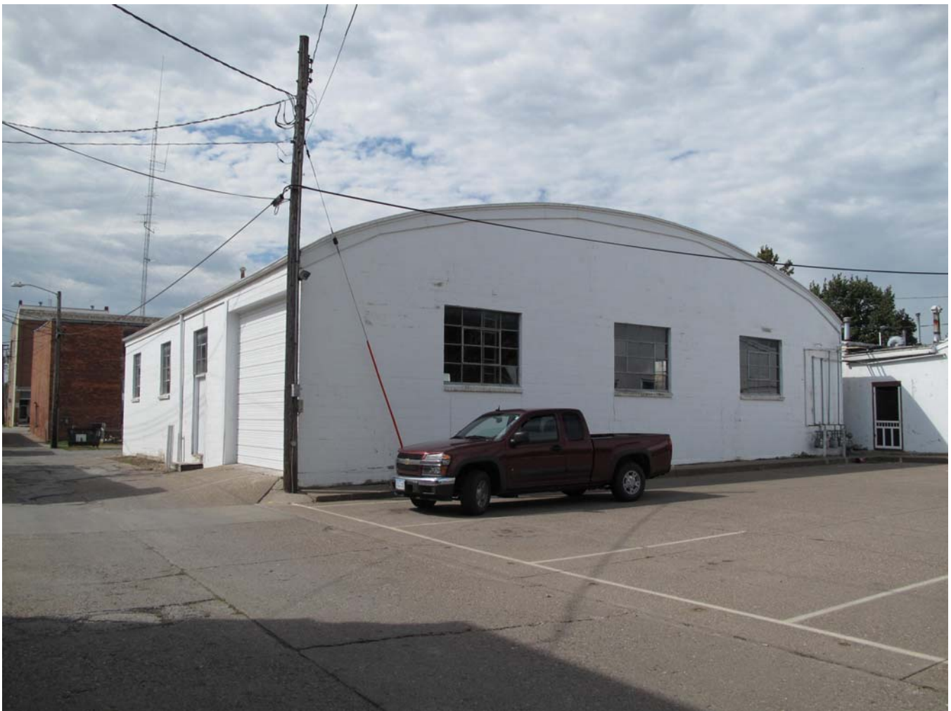
92-00662-001 - South and east elevations, looking northwest (, September 20, 2011)