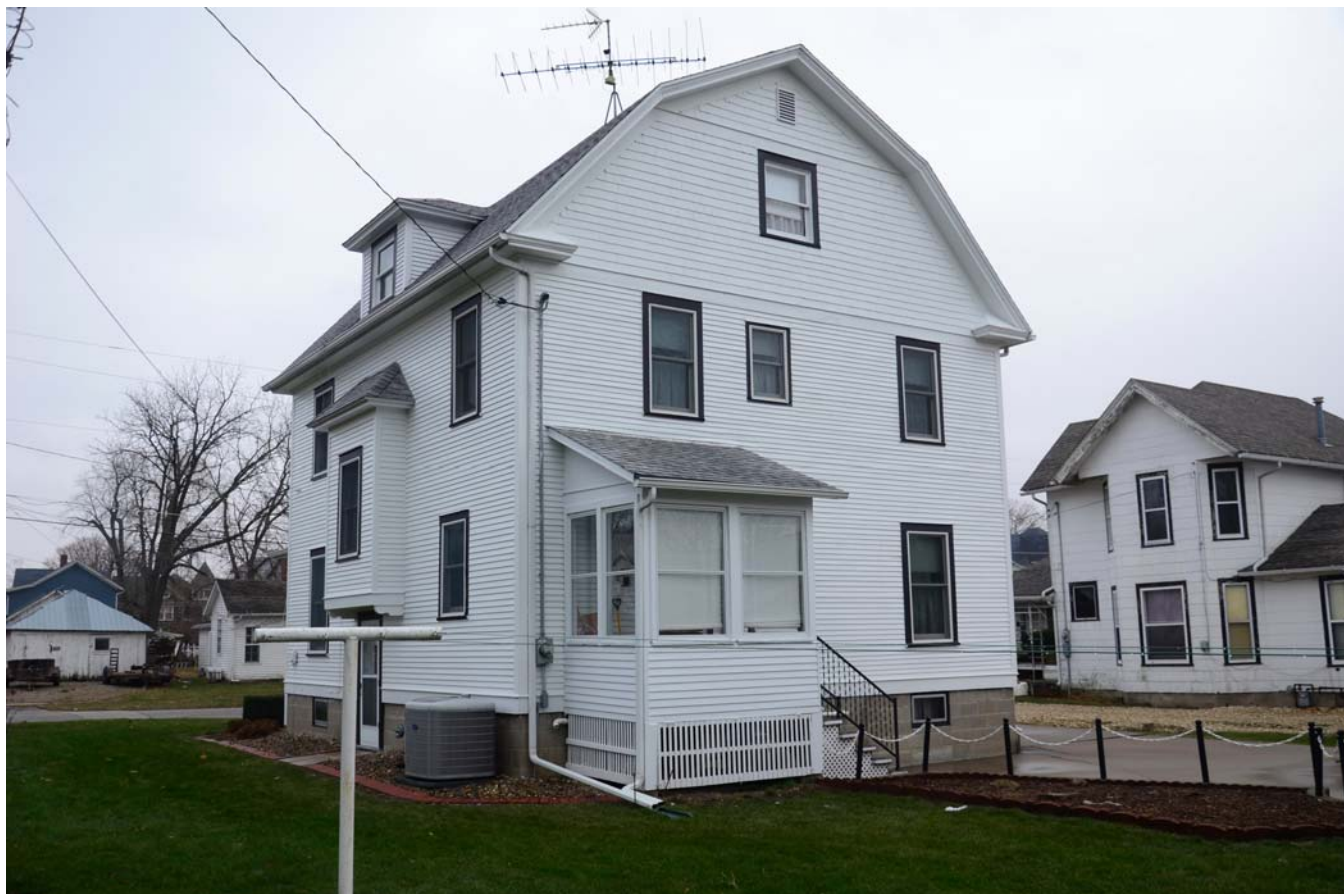
Photograph 92-00738-003 - House, looking southeast (December 2014)