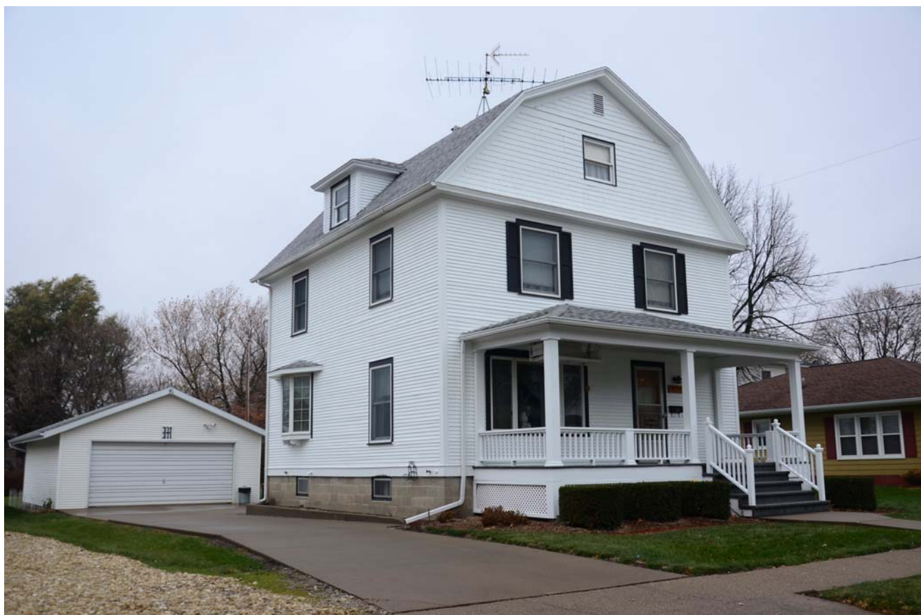
Photograph 92-00738-001 - House, looking northwest (December 2014)