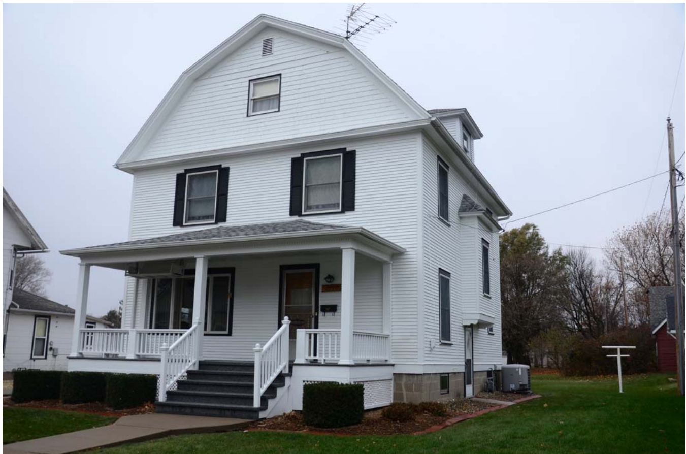
Photograph 92-00738-002 - House, looking southwest (December 2014)