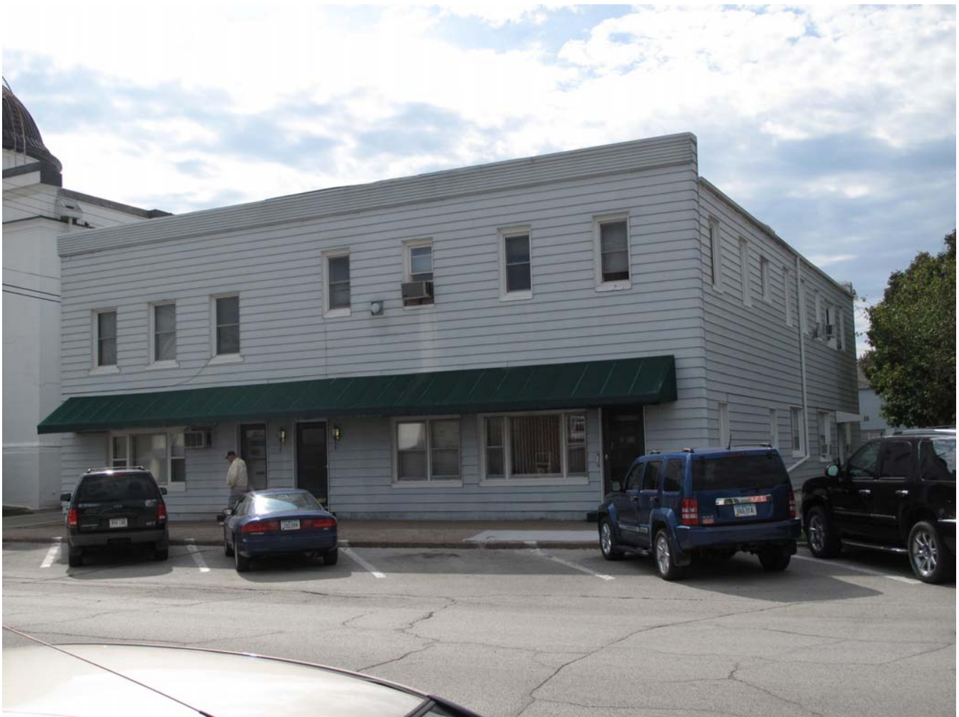
Photograph 92-00555-001 - East and north elevations, looking southwest (, September 20, 2011)