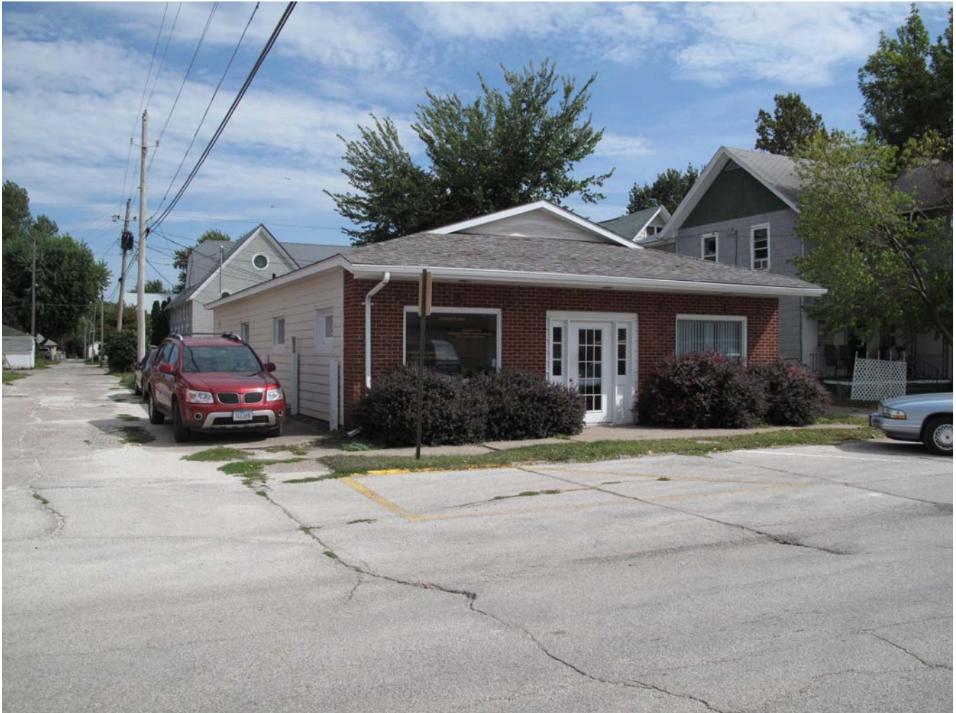
Photograph 92-00505-002 - North and west elevations, looking southeast