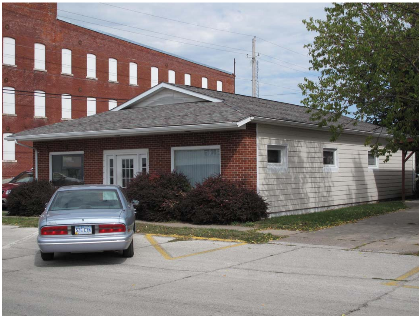
Photograph 92-00505-001 - West and south elevations, looking northeast