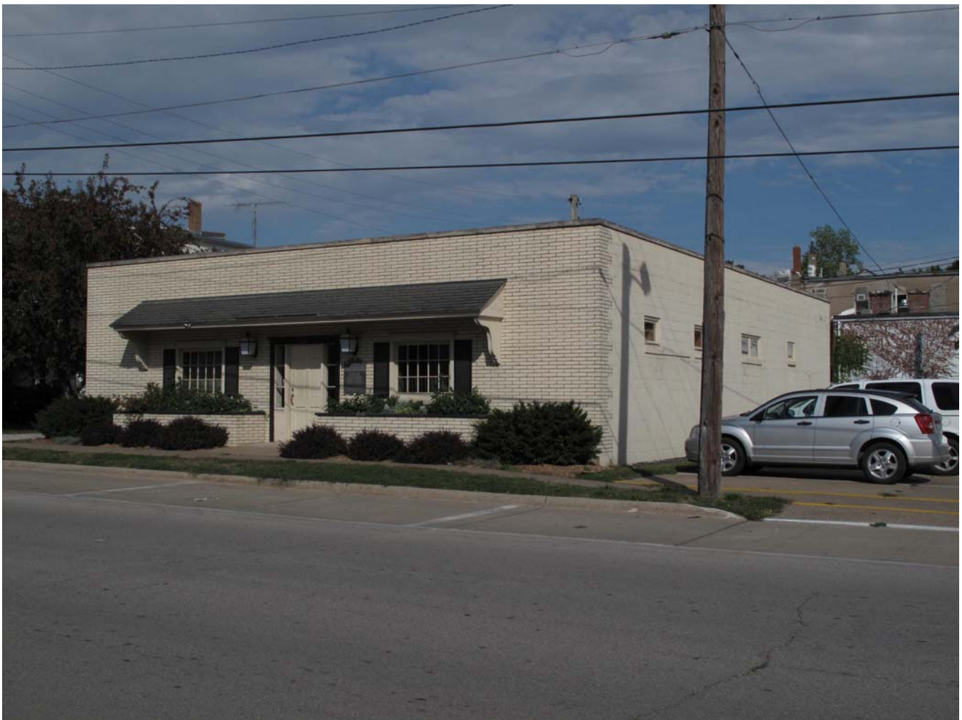
Photograph 92-00497-001 - West and south elevations, looking northeast