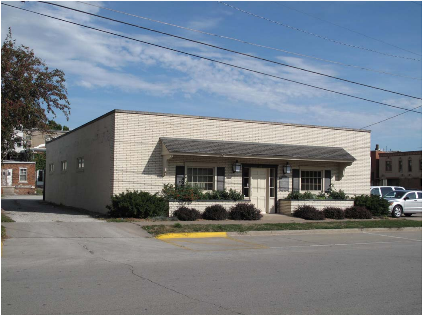
Photograph 92-00497-002 - North and west elevations, looking southeast