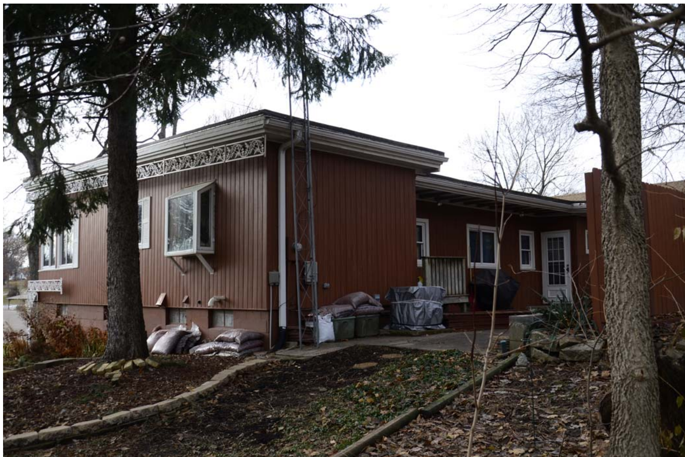
Photograph 92-00770-002 - House, looking southwest (December 2014)