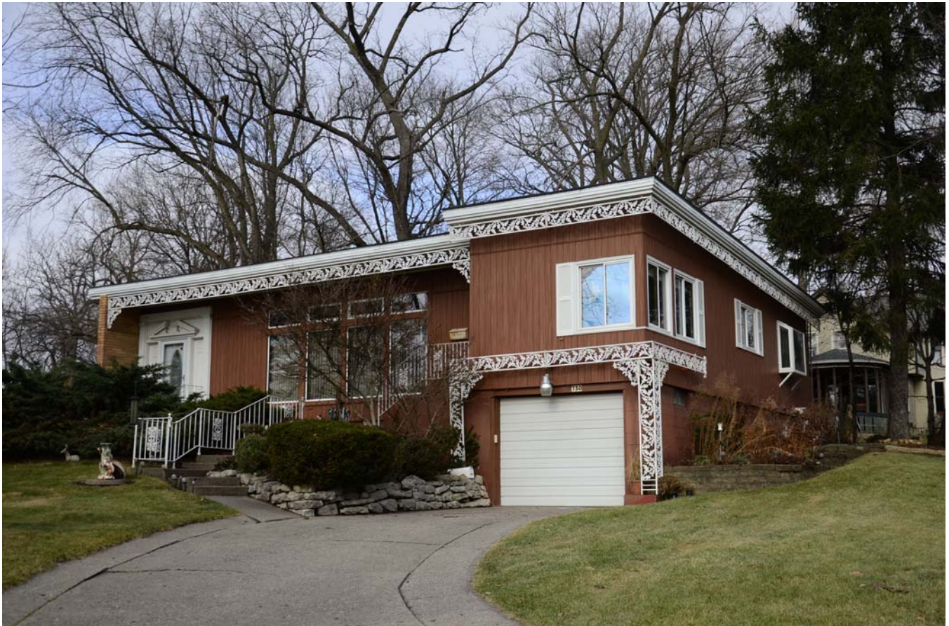
Photograph 92-00770-001 - House, looking northwest (December 2014)