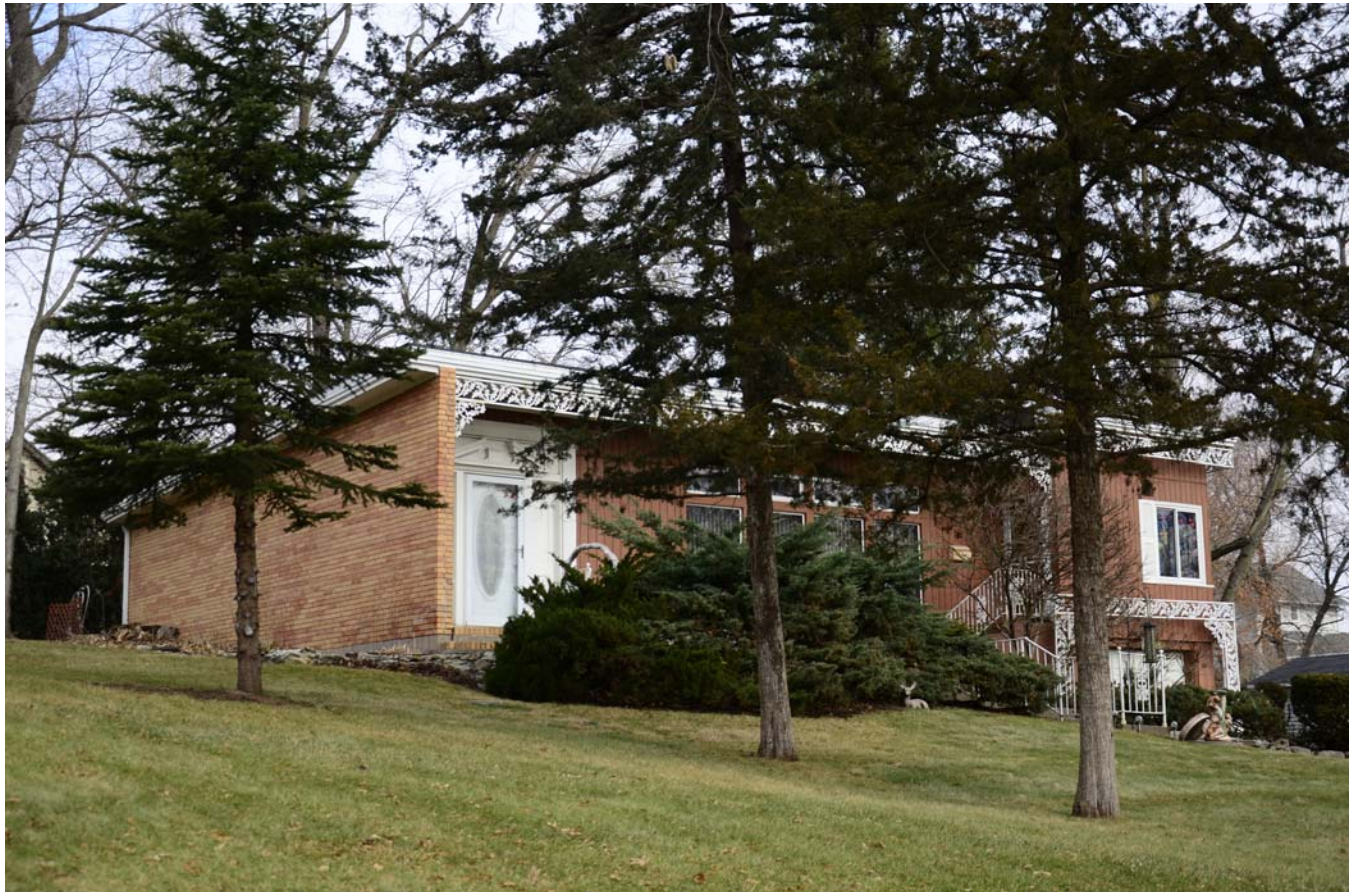
Photograph 92-00770-003 - House, looking northeast (December 2014)