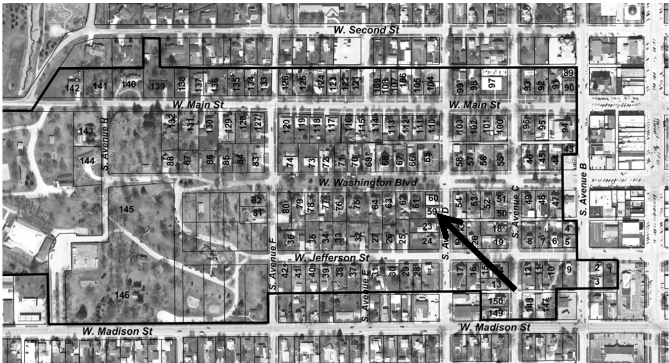
2009 aerial photograph (Washington County) – line indicates survey/research area boundary