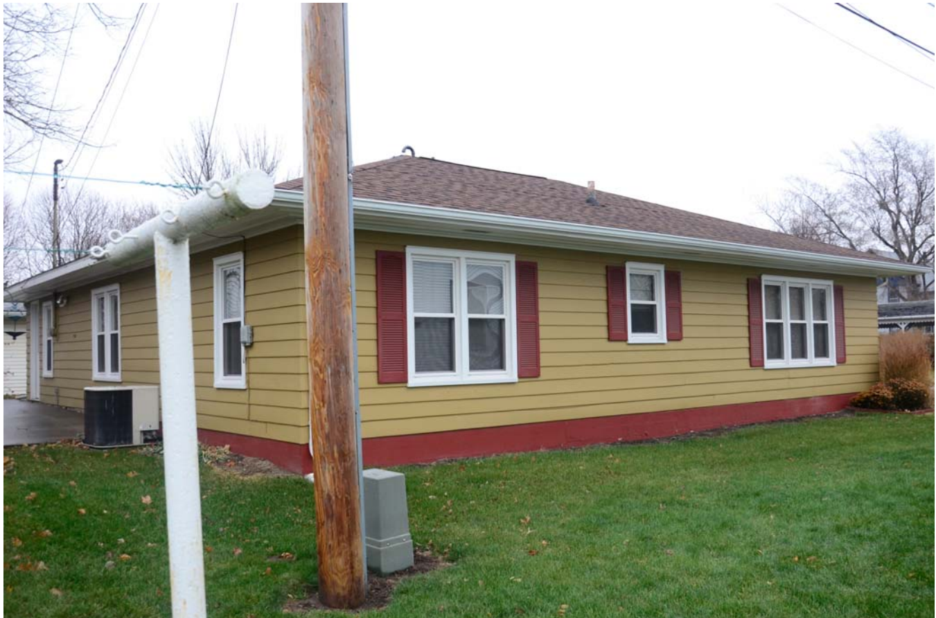
Photograph 92-00760-002 - House, looking northeast (December 2014)