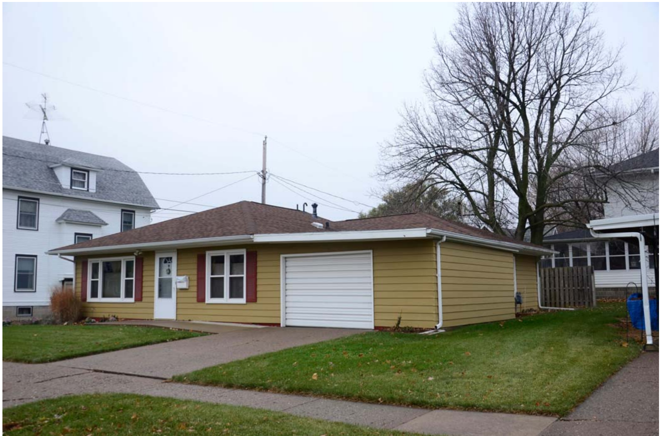
Photograph 92-00760-001 - House, looking southwest (December 2014)