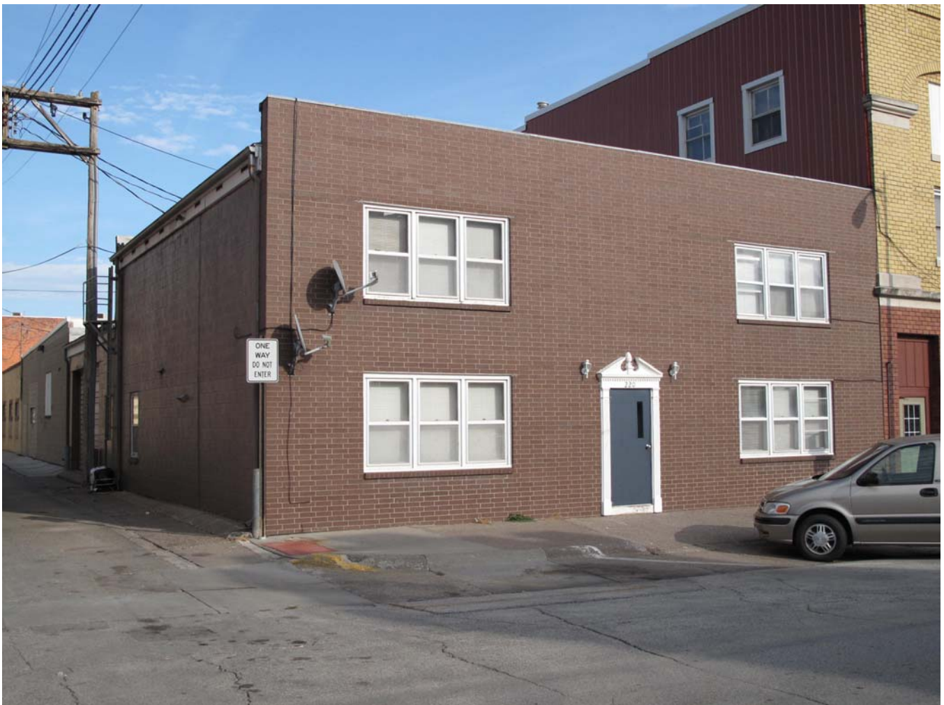
Photograph 92-00573-001 - North and west elevations, looking southeast