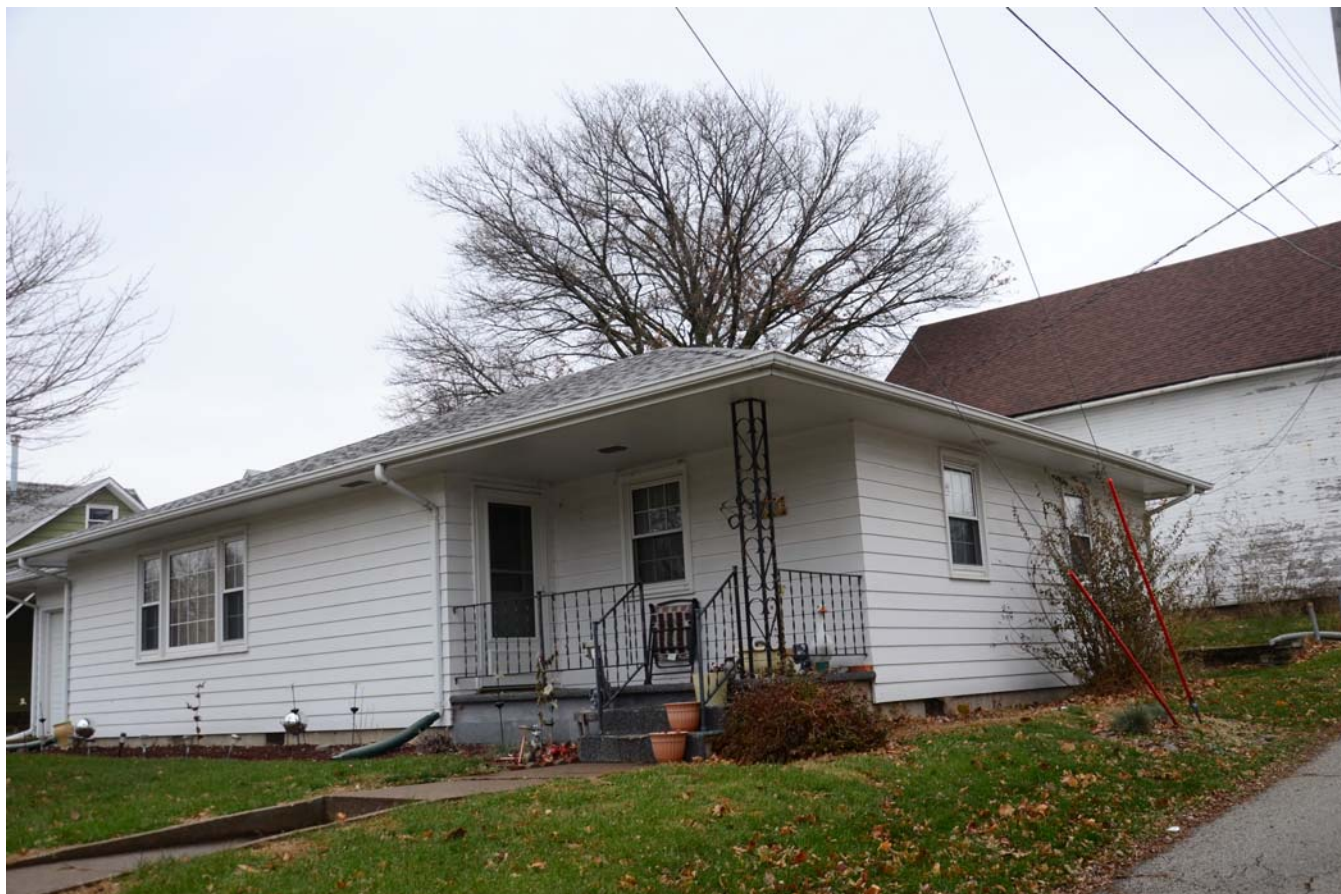
Photograph 92-00729-001 - House, looking northeast (December 2014)