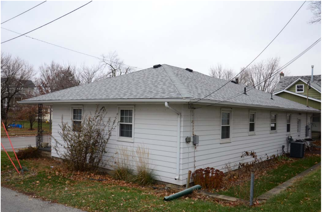
Photograph 92-00729-003 - House, looking northwest (December 2014)