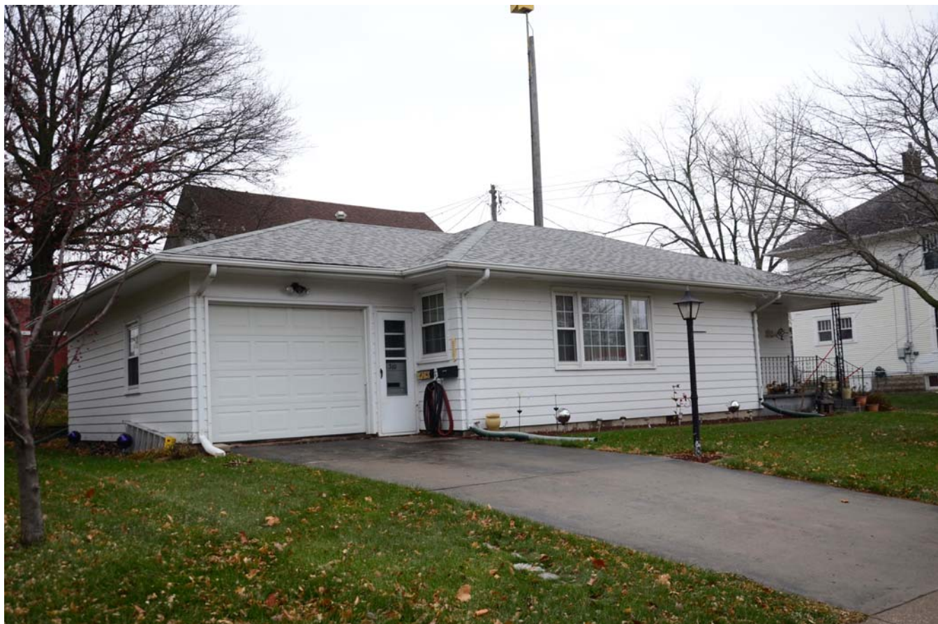
Photograph 92-00729-002 - House, looking southeast (December 2014)