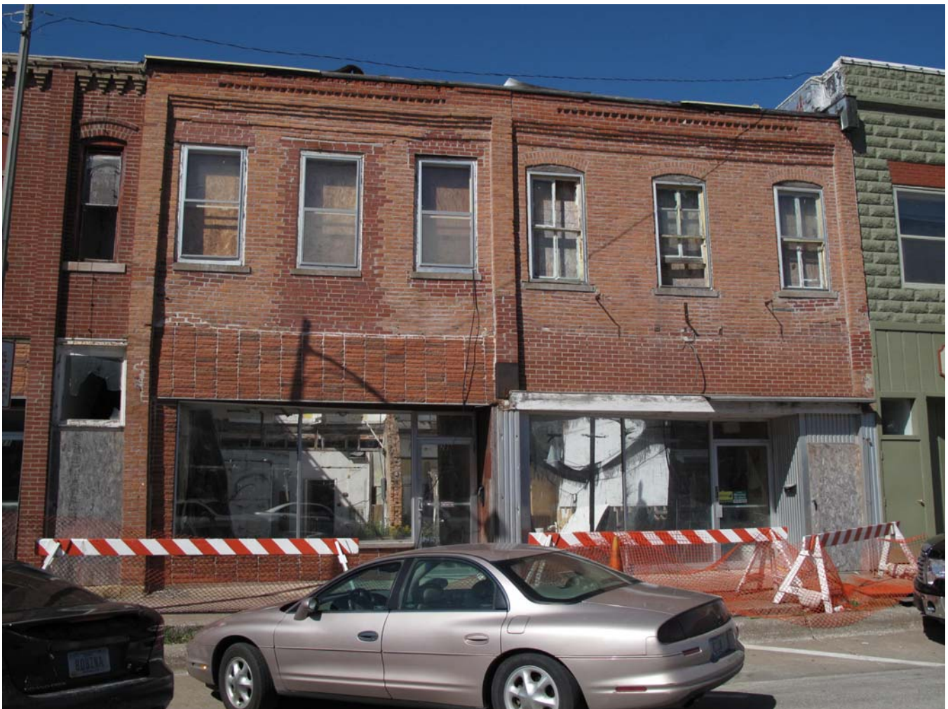
Photograph 92-00568-001 - East elevation, looking west