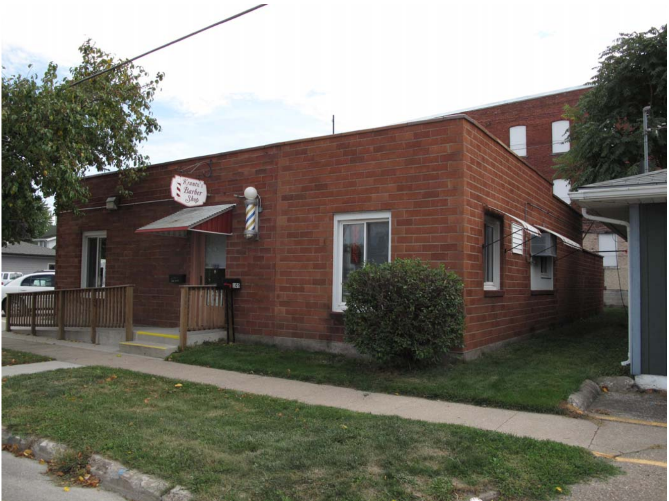
92-00588-001 - North and west elevations, looking southeast