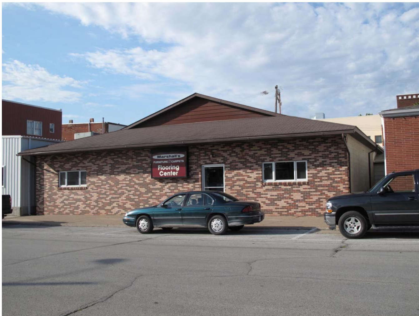
Photograph 92-00526-001 - South elevation, looking north