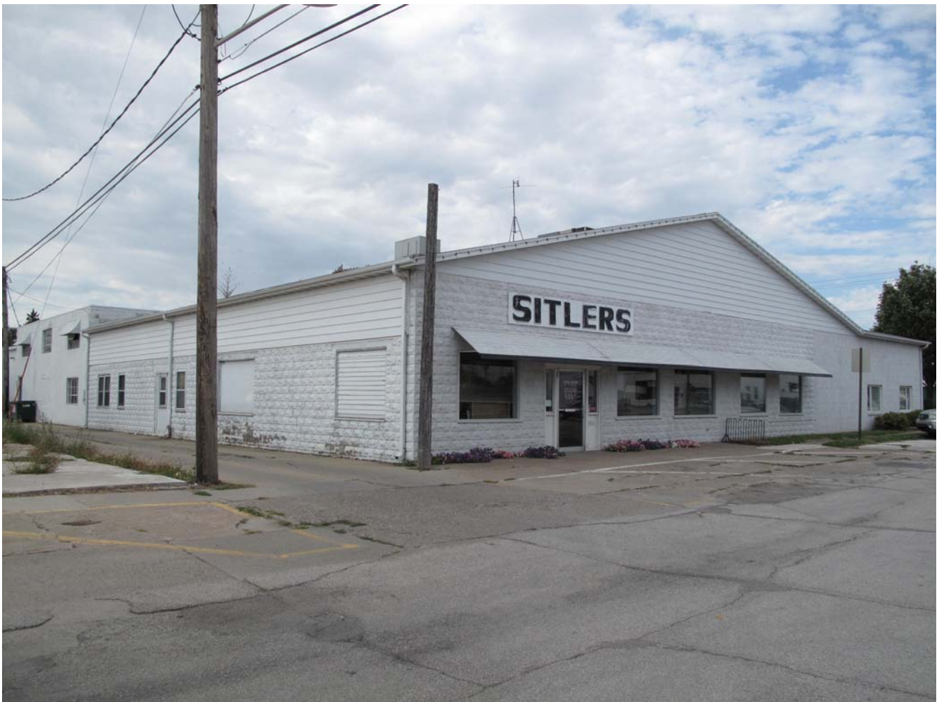
Photograph 92-00506-001 - South and east elevations of original building, looking northwest