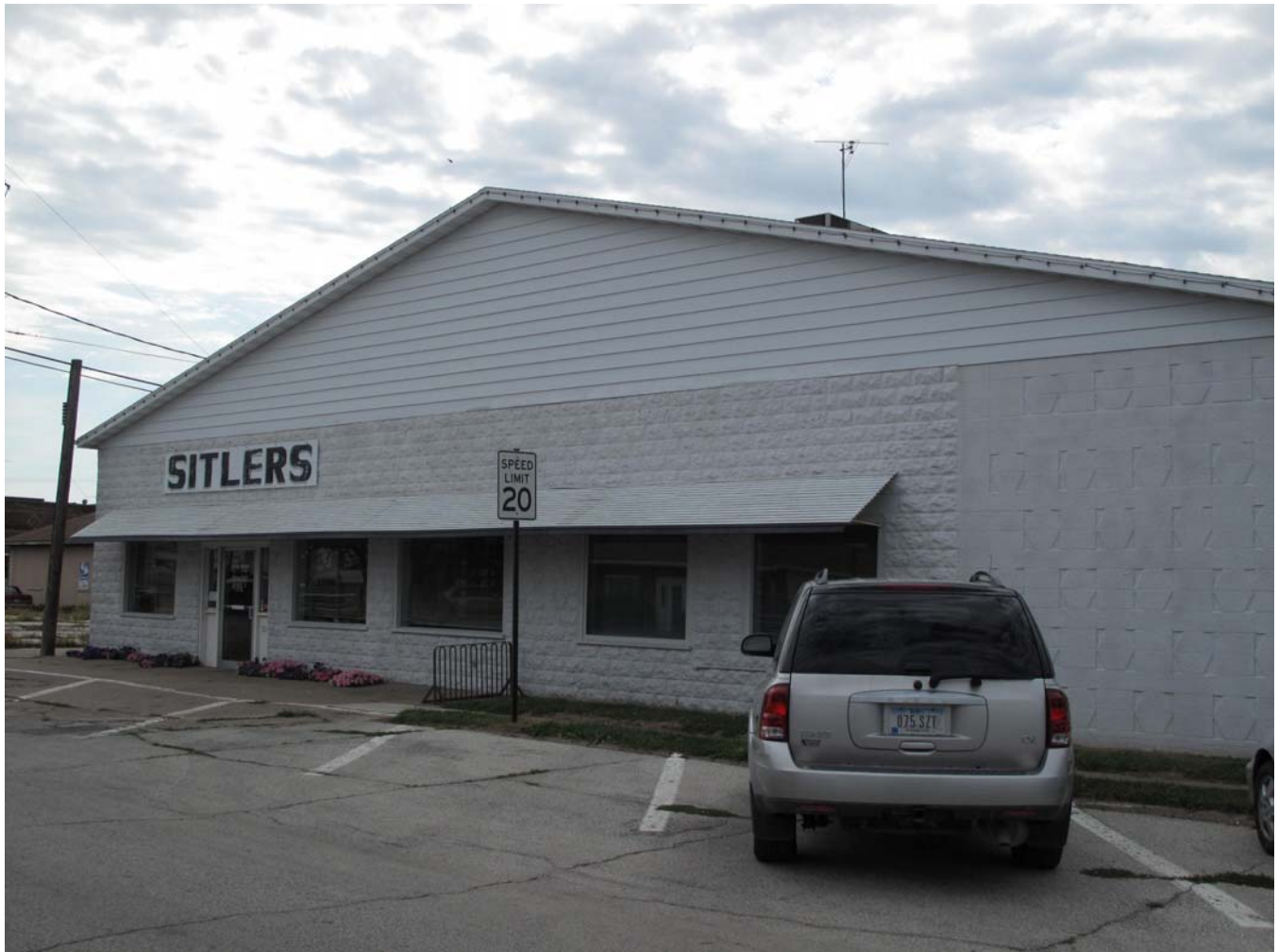
Photograph 92-00506-002 - East elevations of original building and north side addition with combined gable roof, looking southwest