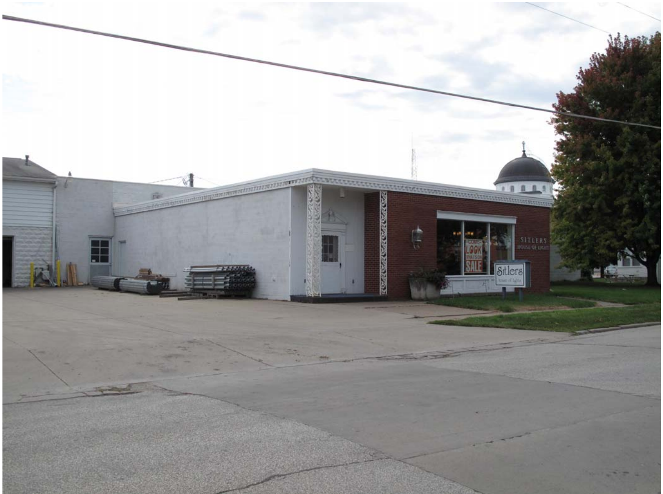
Photograph 92-00506-003 - East and north elevations of 1962 showroom addition, looking southwest