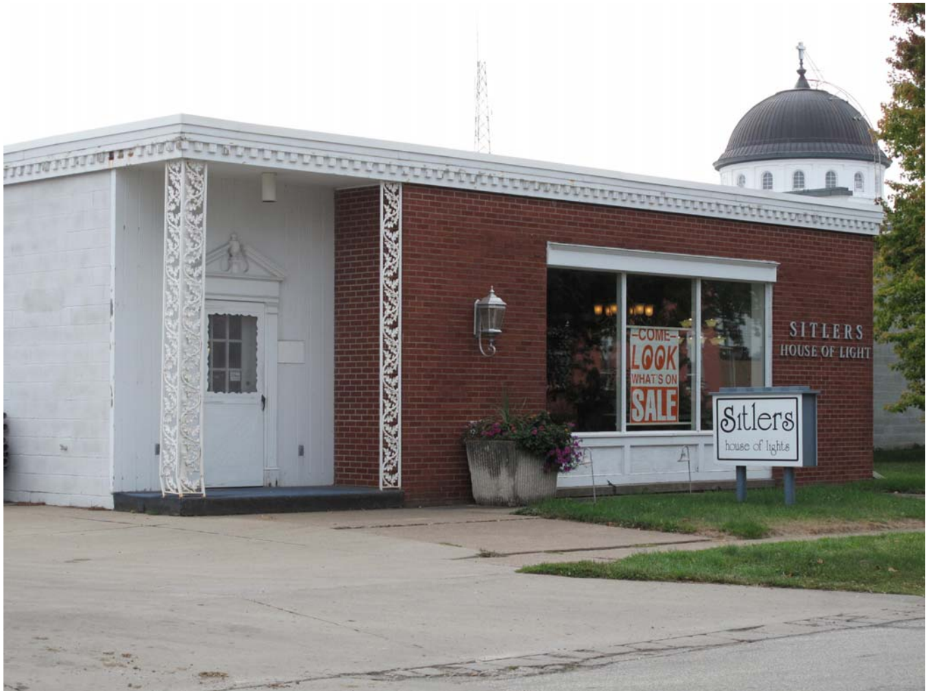
Photograph 92-00506-004 - North elevation of 1962 showroom addition, looking southwest