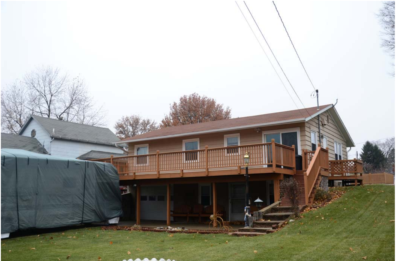
Photograph 92-00755-002 - House, looking northwest (December 2014)