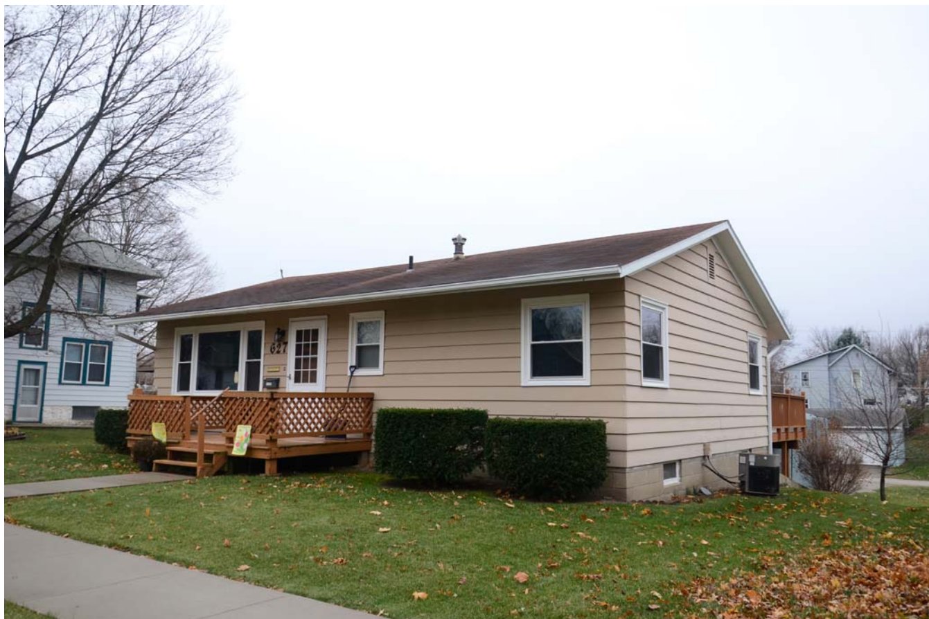
Photograph 92-00755-001 - House, looking southeast (December 2014)