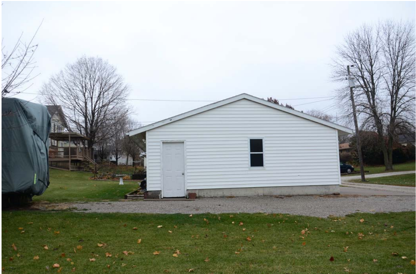
Photograph 92-00755-003 - Garage, looking east (December 2014)