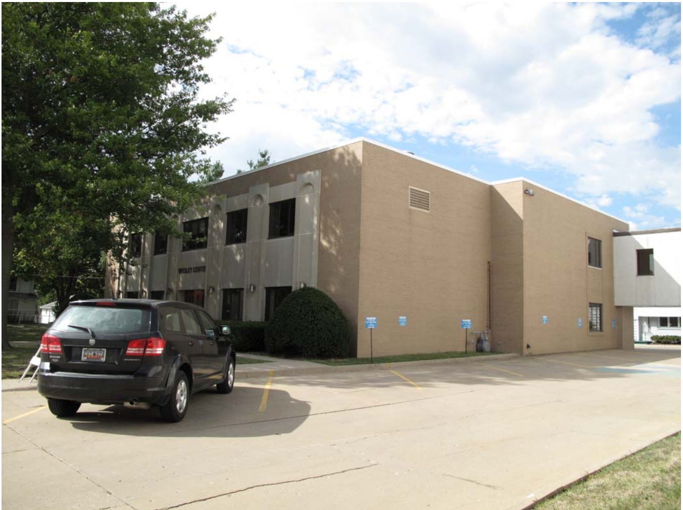
Photograph 92-00584-002 - South and east elevations, looking northwest