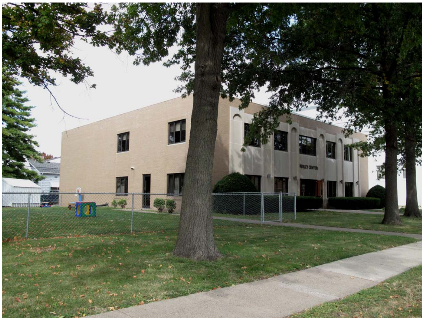
Photograph 92-00584-001 - West and south elevations, looking northeast (, September 20, 2011)