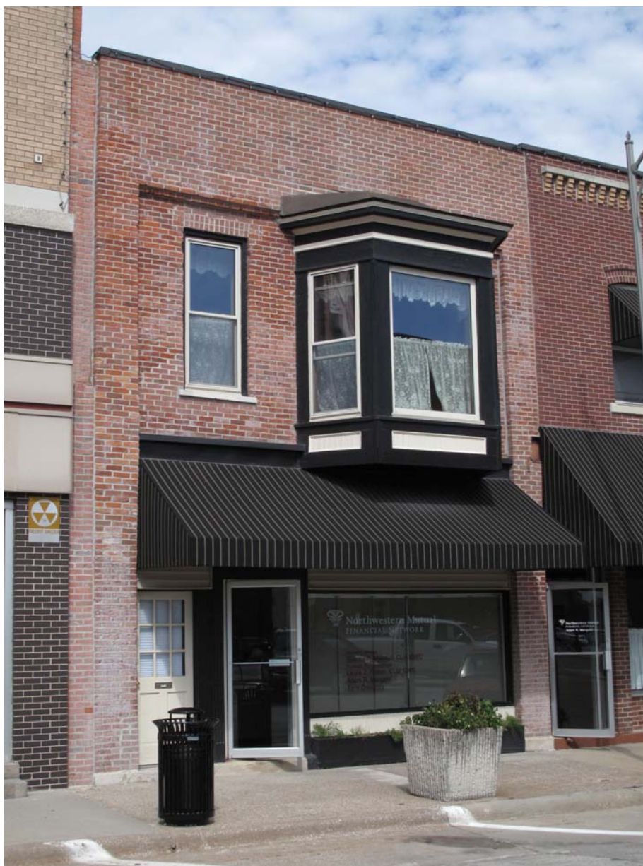
Photograph 92-00521-001 - South elevation, looking northeast (, September 20, 2011)