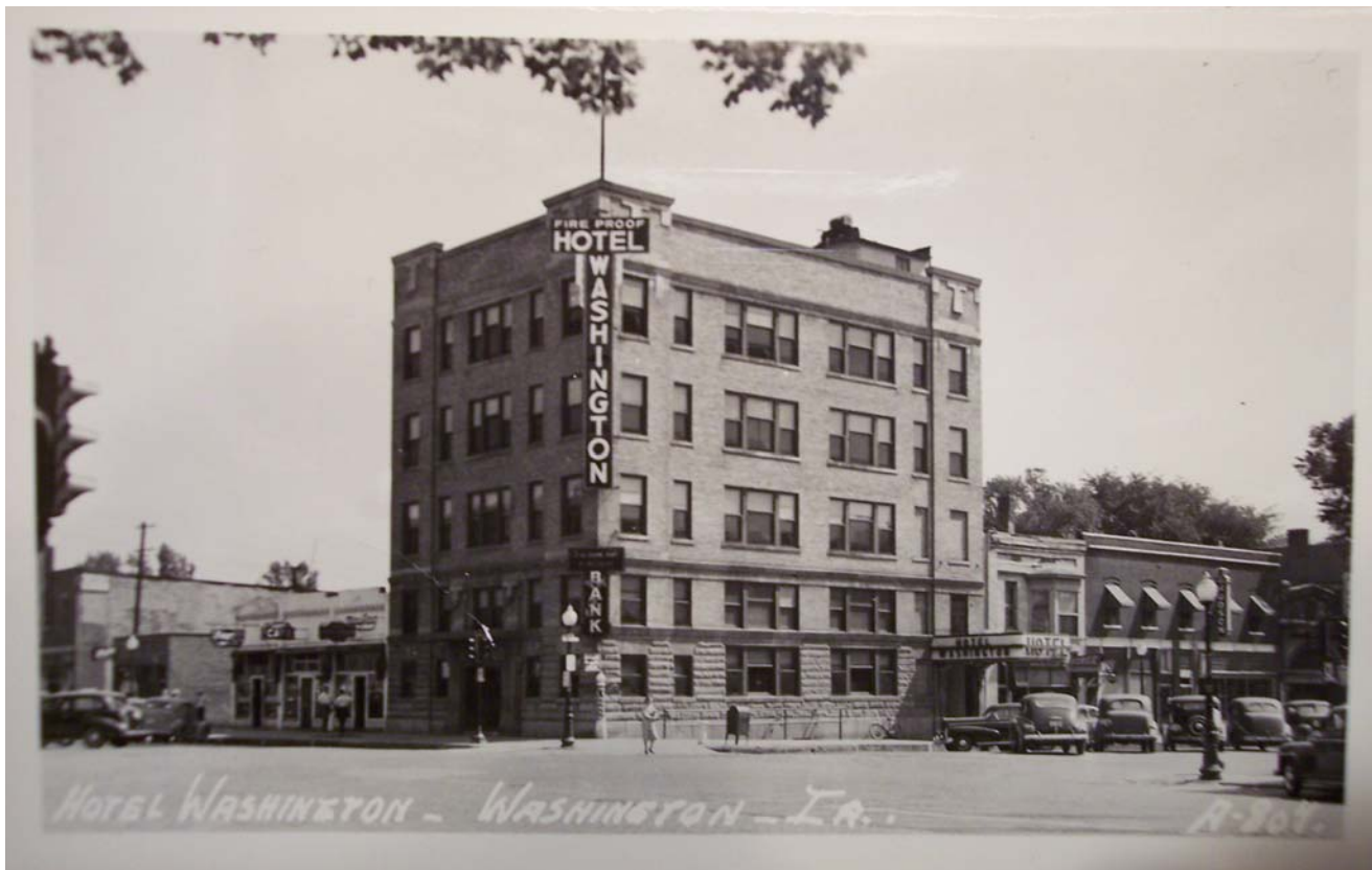
Photograph of building in 1930s.