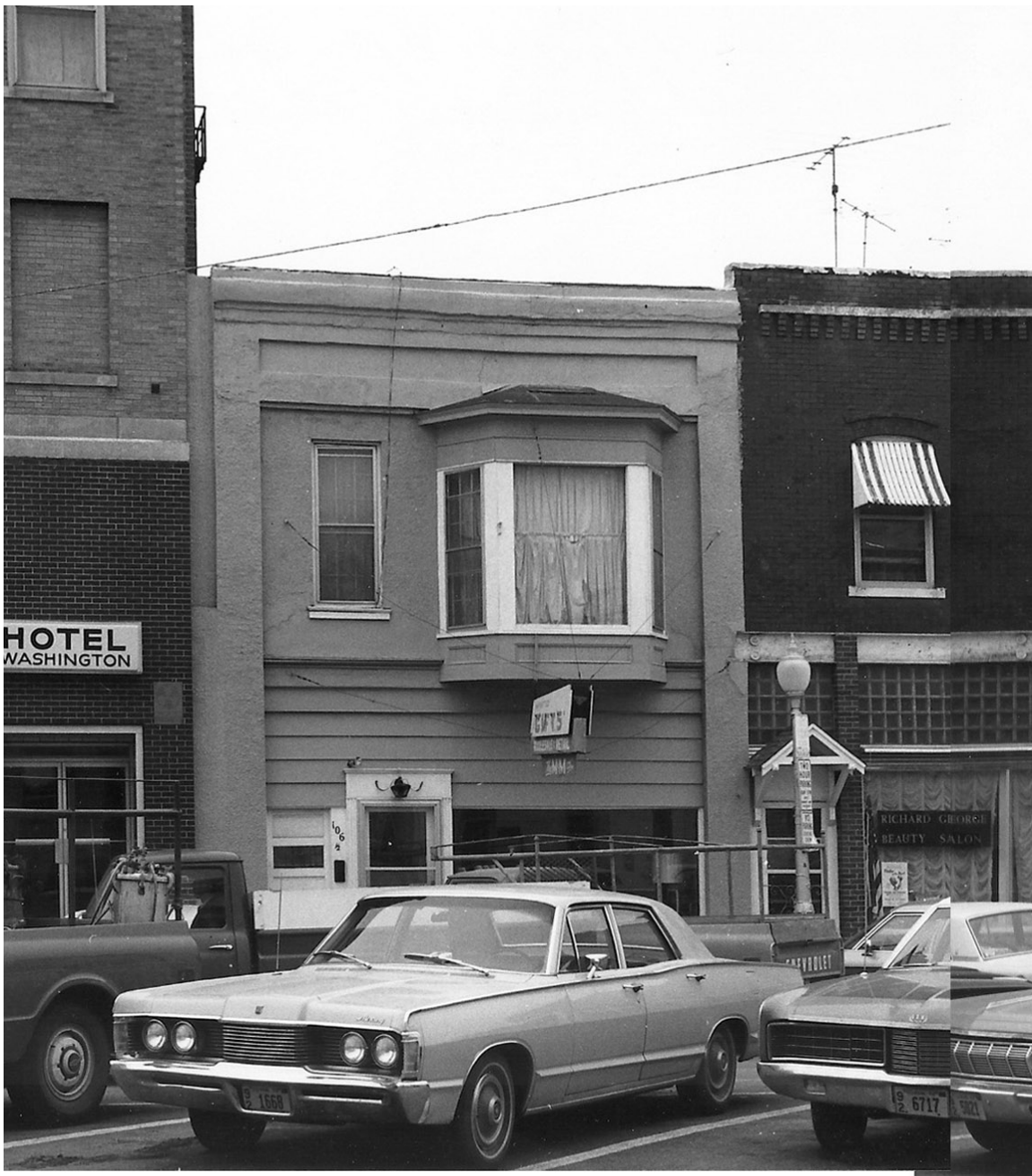
Building in 1971 (Wagner 1971).