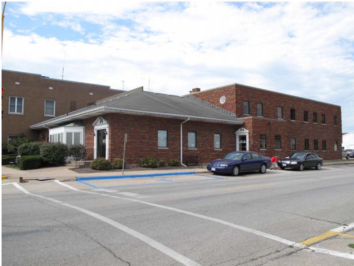
Photograph 92-00161-002 - South and east elevations, looking northwest.