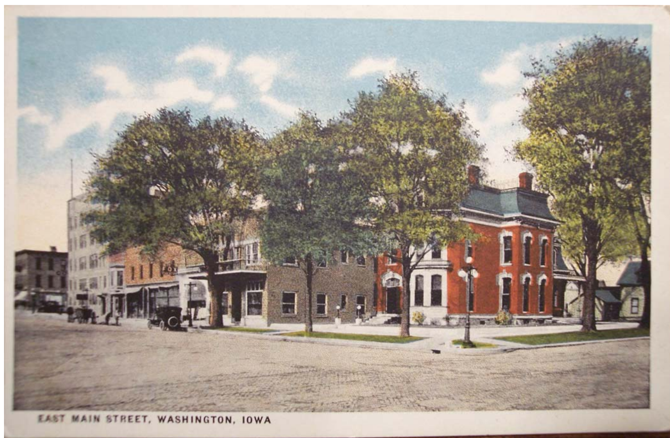
Chilcote Library building at east end of Main Street - demolished for this building