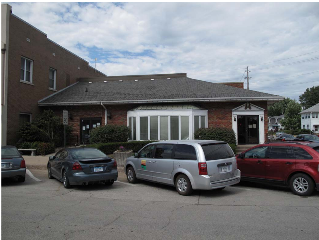
Photograph 92-00161-001 - South elevation, looking north.