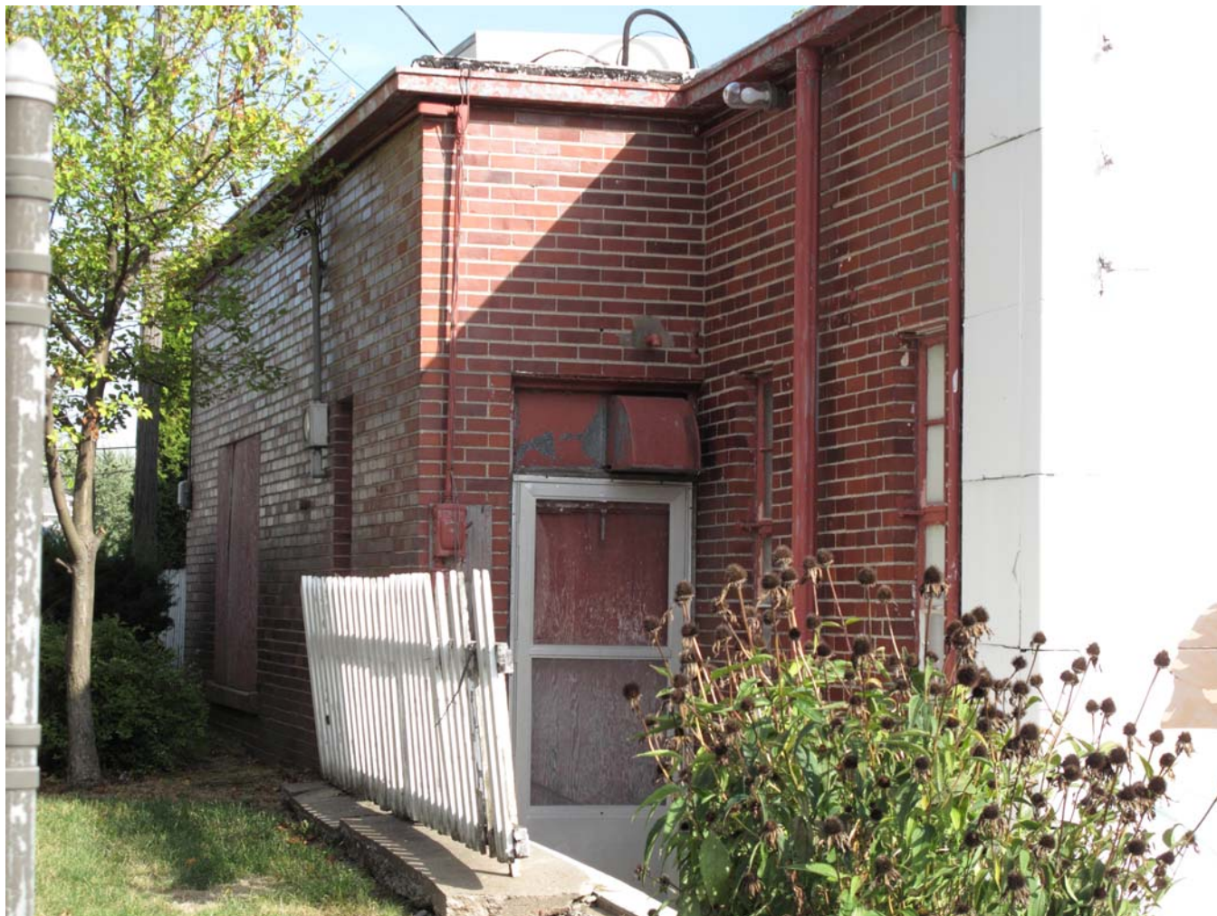
Photograph 92-00600-003 - North elevation, looking southeast