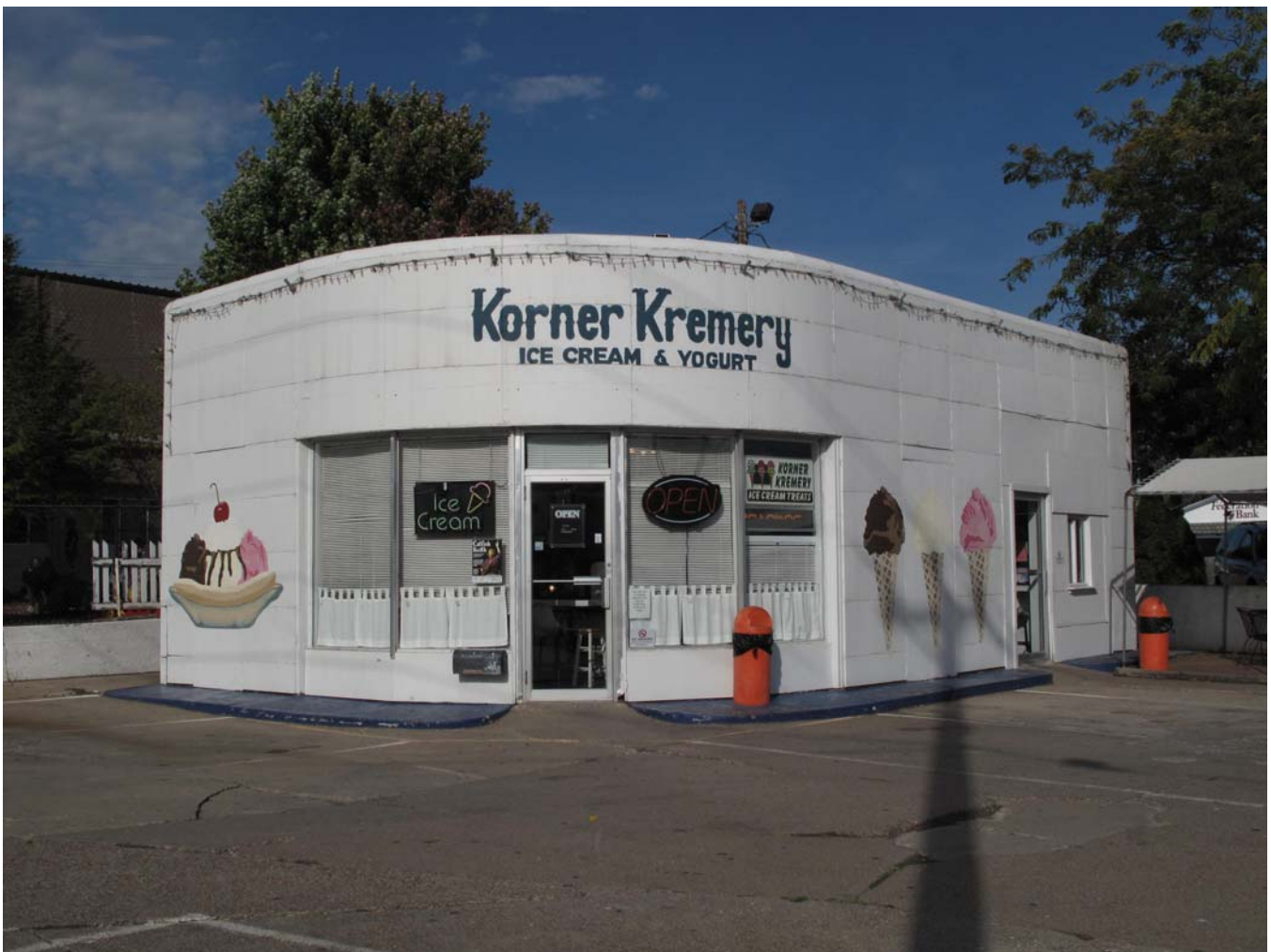
Photograph 92-00600-001 - West and south elevations, looking northeast