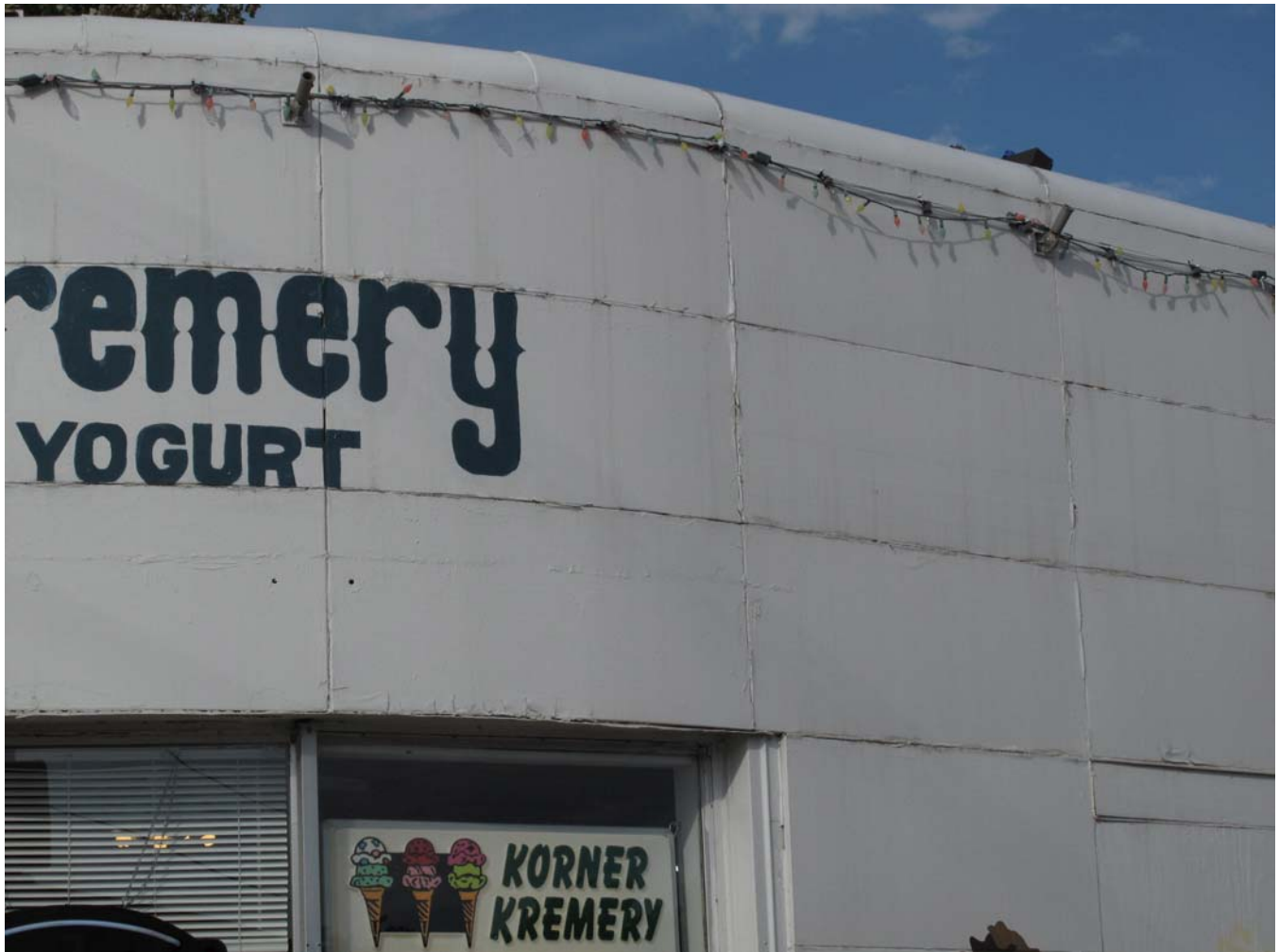
Photograph 92-00600-002 - Detail of wall, looking northeast