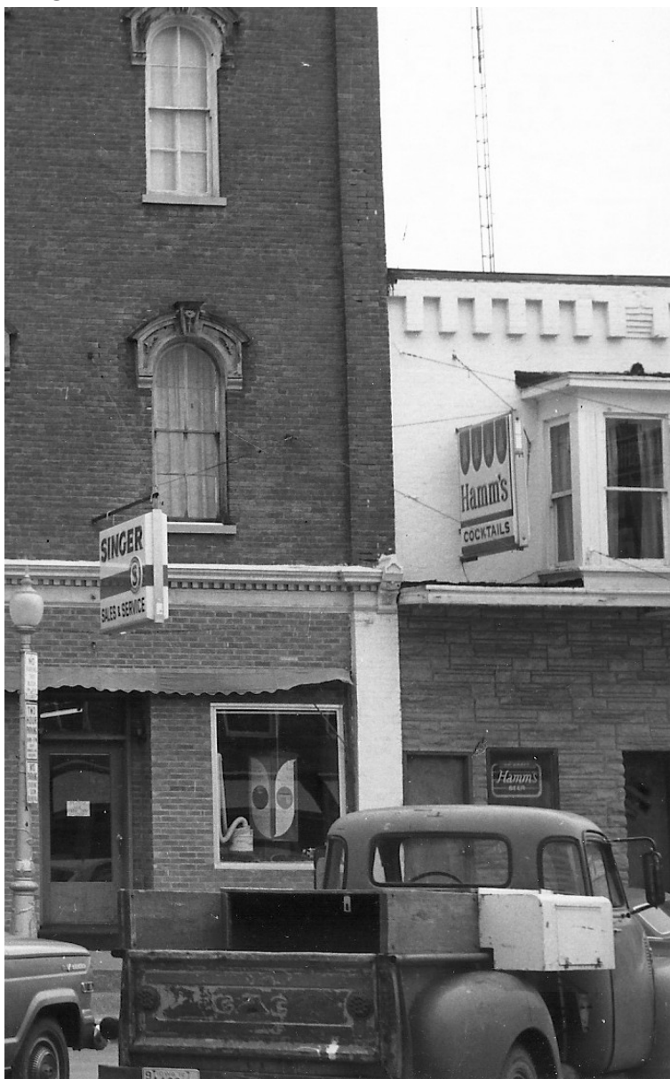
Edge of building in 1971 photograph (Wagner 1971)