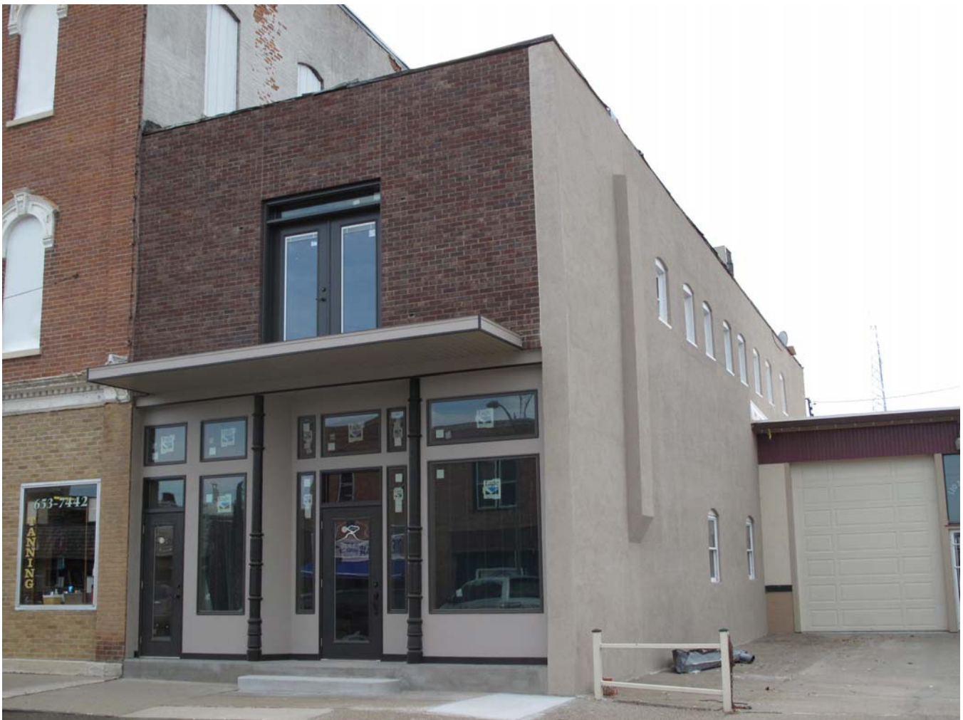
Photograph 92-00503-001 - East and north elevations, looking southwest